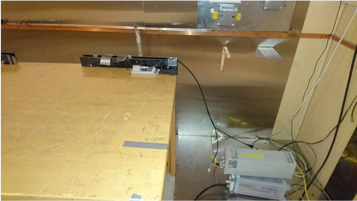
Power line Conducted Emissions Test