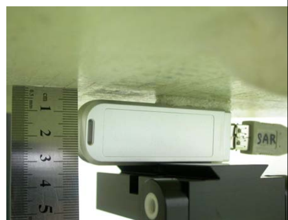
D. The edge (left) of the EUT face to the phantom with 5mm-separation distance.