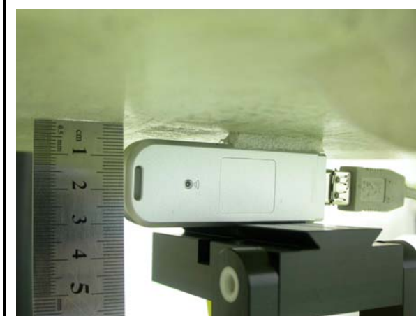
C. The edge (right) of the EUT face to the phantom with 5mm-separation distance.