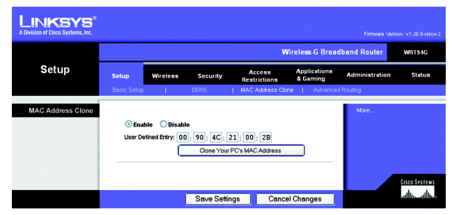
Figure E-5: MAC Address Clone