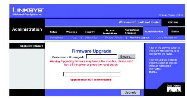
Figure C-1: Upgrade Firmware