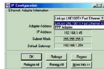
Figure E-1: IP Configuration Screen