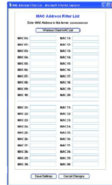
Figure E-4: MAC Address Filter List

For MAC address cloning, enter the 12-digit MAC address in the MAC Address fields provided, two digits per field.