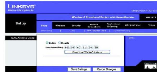
Figure E-5: MAC Address Clone