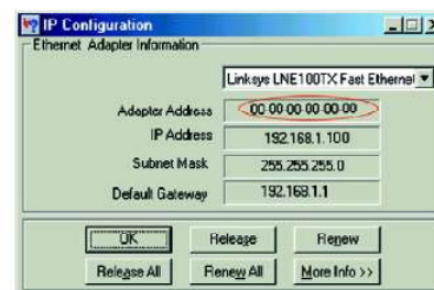
Figure E-2: MAC Address/Adapter Address