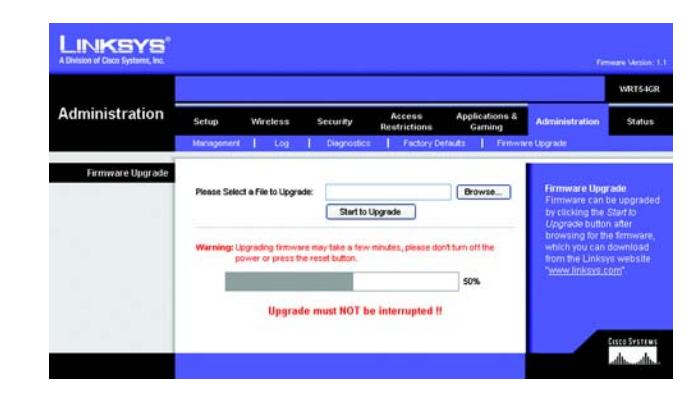
Figure 5-46: Administration Tab - Firmware Upgrade

Help information is shown on the right-hand side of the screen.