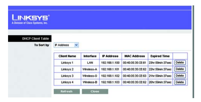
Figure 5-50: DHCP Clients Table