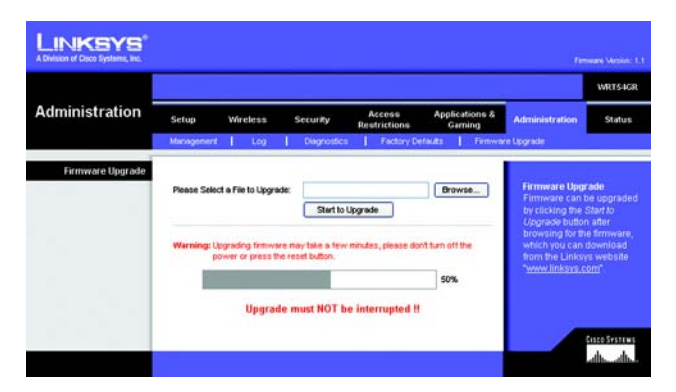
Figure C-1: Upgrade Firmware