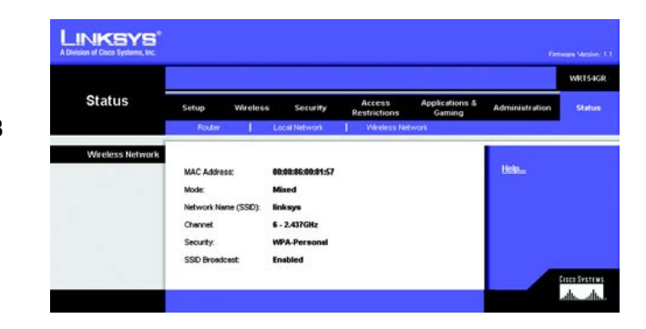
Figure 5-51: Status Tab - Wireless Network