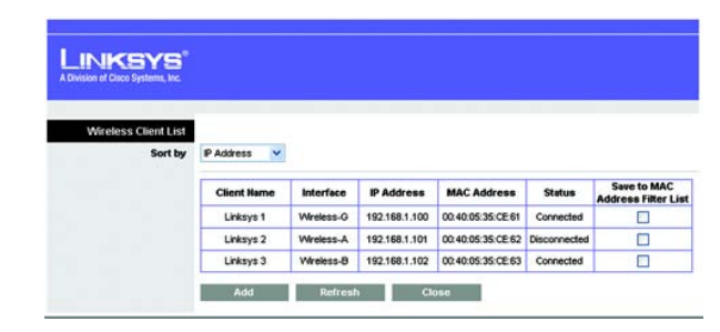
Figure E-5: Wireless Client List