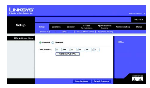
Figure E-6: MAC Address Cloning