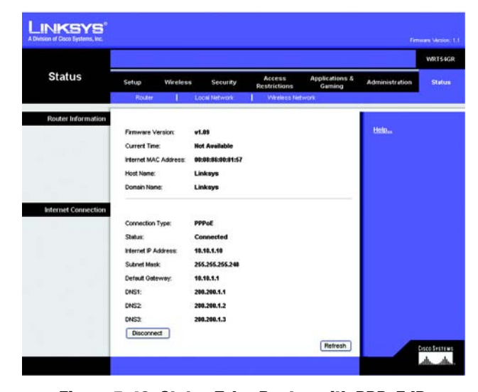
Figure 5-48: Status Tab - Router with PPPoE IP Connection