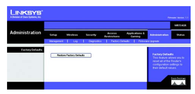
Figure 5-45: Administration Tab - Factory Defaults

Click the Restore Factory Defaults button to reset all configuration settings to their default values. Any settings you have saved will be lost when the default settings are restored. This feature is disabled by default.