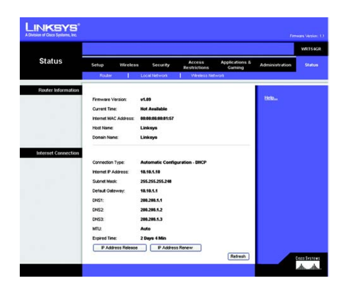
Figure 5-47: Status Tab - Router

IP Address Renew . Available for a DHCP connection, click this button to replace the current IP address—of the device connected to the Router's Internet port—with a new IP address.