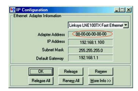
Figure E-2: MAC Address/Adapter Address