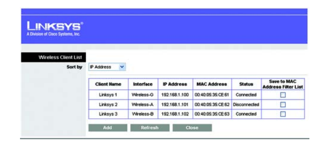
Figure E-5: Wireless Client List