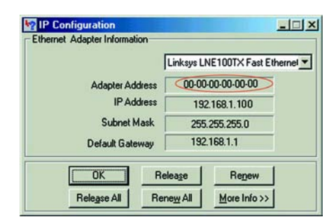
Figure E-2: MAC Address/Adapter Address