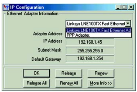
Figure E-1: IP Configuration Screen