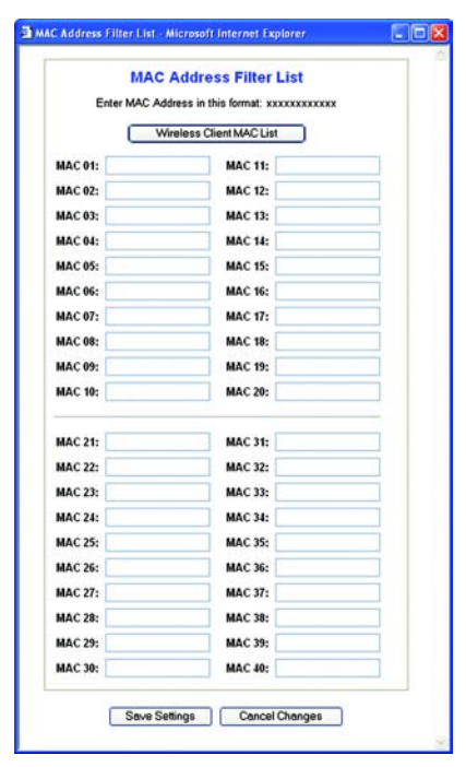
Figure E-4: MAC Address Filter List

For MAC address cloning, enter the 12-digit MAC address in the User Defined Entry fields provided, two digits per field. See Figure E-5.