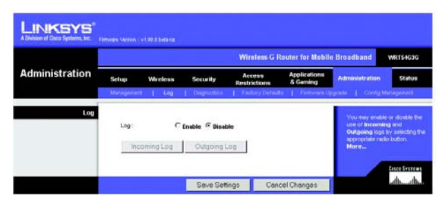
Figure 8-41: Administration Tab - Log

Change these settings as described here, and click the Save Settings button to apply your changes or Cancel Changes to cancel your changes.