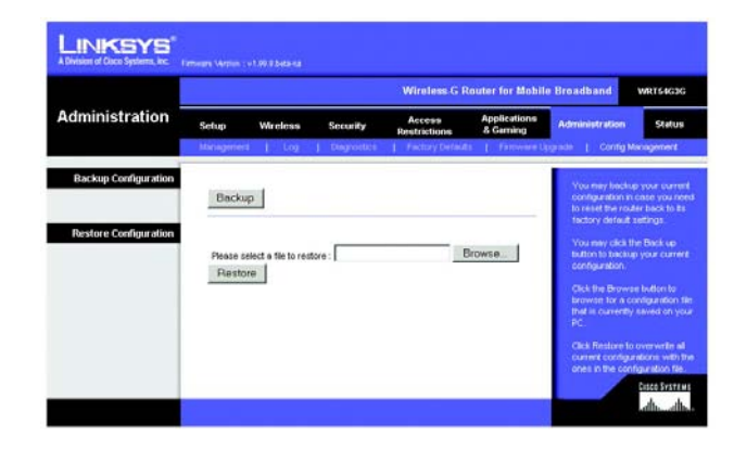
Figure 8-47: Administration Tab - Config Management

To restore the Router's configuration file, click the Browse button to locate the file, and follow the on-screen instructions. After you have selected the file, click the Restore button.