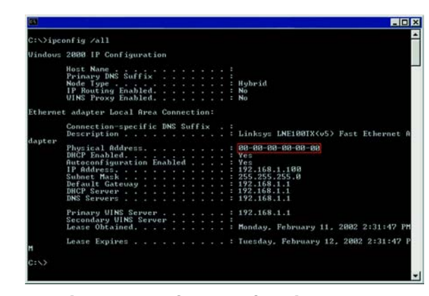
Figure E-3: MAC Address/Physical Address