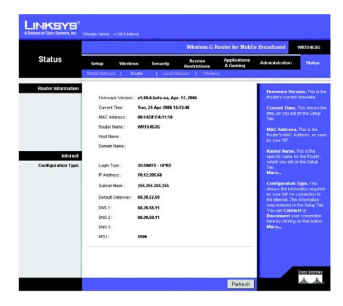
Figure 8-49: Status Tab - Router

Configuration Type . Displayed here is the information required by your ISP for connection to the Internet. This information was entered on the Setup Tab.