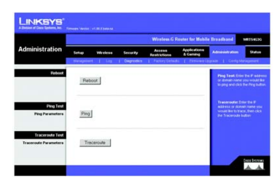
Figure 8-42: Administration Tab - Diagnostics

Traceroute Parameters . To test the performance of a connection, click the Traceroute button. Enter the address of the PC whose connection you wish to test and click the Traceroute button. The Traceroute screen will then display the test results. To stop the test, click the Stop button. Click the Clear Log button to clear the screen. Click the Close button to return to the Diagnostics screen.