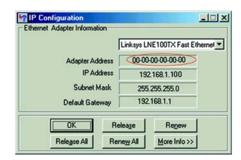
Figure E-2: MAC Address/Adapter Address