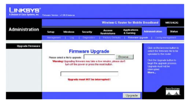
Figure 8-46: Administration Tab - Firmware Upgrade

Please select a file to upgrade . Click the Browse button to find the extracted firmware file. Then click the Upgrade button. For more information about upgrading firmware, refer to "Appendix C: Upgrading Firmware".