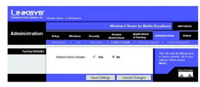
Figure 8-45: Administration Tab - Factory Defaults

Restore Factory Defaults . Click the Yes button to reset all configuration settings to their default values, and then click the Save Settings button. Any settings you have saved will be lost when the default settings are restored. This feature is disabled by default. Click the Cancel Changes button to cancel your change.