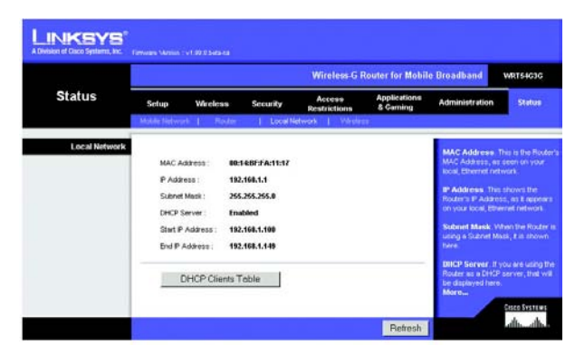
Figure 8-50: Status Tab - Local Network

DHCP Clients Table. Clicking this button will open a screen to show you which PCs are utilizing the Router as a DHCP server. You can delete PCs from that list, and sever their connections, by checking a Delete box and clicking the Delete button.