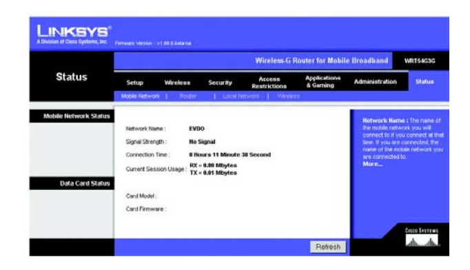
Figure 8-48: Status Tab - Mobile Network

Card Firmware. This is the firmware version of your broadband mobile data card.