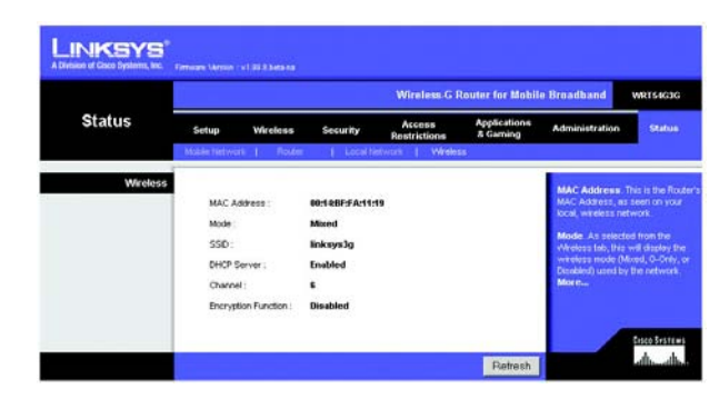
Figure 8-51: Status Tab - Wireless

Encryption Function . As selected on the Wireless Security Tab, this will display what type of encryption the Router uses for security.