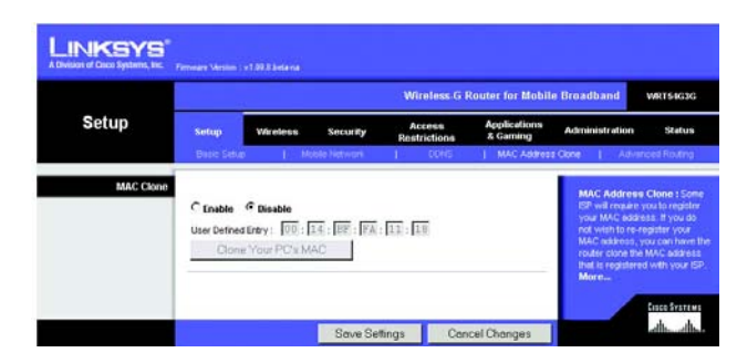
Figure E-5: MAC Address Clone