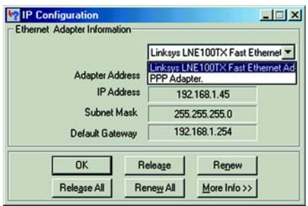
Figure E-1: IP Configuration Screen