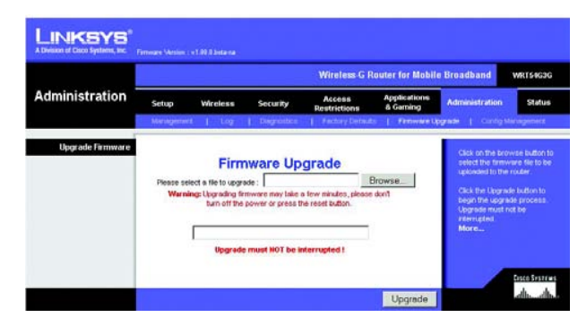
Figure C-1: Upgrade Firmware