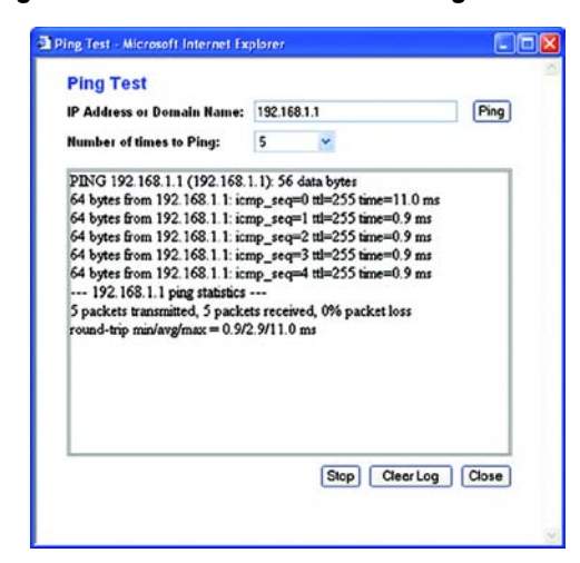
Figure 8-43: The Ping Test