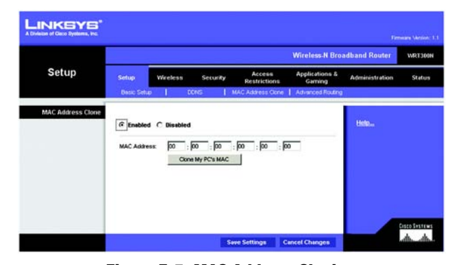
Figure E-5: MAC Address Cloning