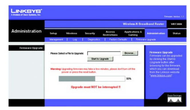
Figure C-1: Firmware Upgrade