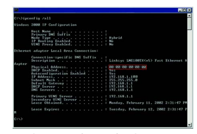
Figure E-3: MAC Address/Physical Address