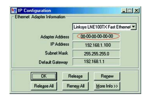
Figure E-2: MAC Address/Adapter Address