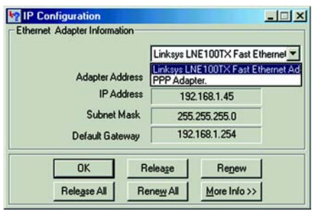
Figure E-1: IP Configuration Screen

NOTE: The MAC address is also called the Adapter Address.