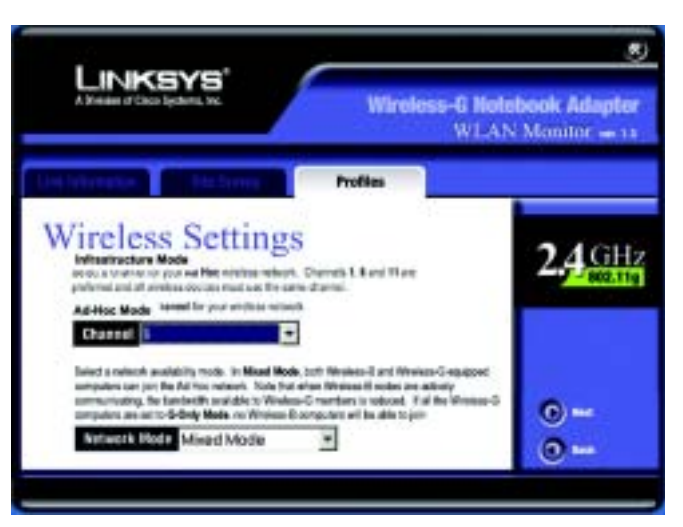
Figure 6-12: Wireless Settings for New Profile

Network Mode - Select Mixed Mode, and both Wireless-G and Wireless-B computers will be allowed on the network, but the speed may be reduced. Select G-Only Mode for maximum speed, but no Wireless-B users will be allowed on the network. Select B-Only Mode for Wireless-B users only.