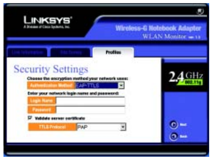
Figure 6-21: EAP-TTLS Authentication

Click the Next button to continue. Click the Back button to return to the previous screen.