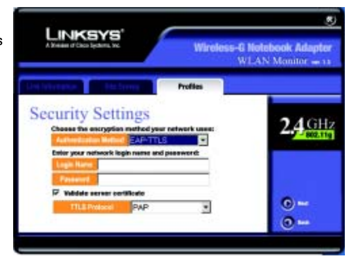
Figure 6-27: EAP-TTLS Authentication

Click the Next button to continue. Click the Back button to return to the previous screen.