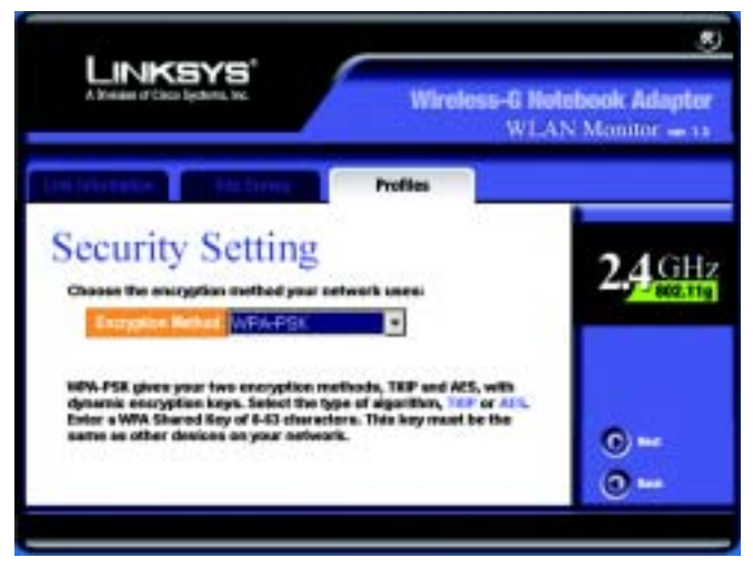
Figure 6-16: WPA-PSK Settings

WPA-PSK, Wi-Fi Protected Access-Pre-Shared Key, offers two encryption methods, TKIP and AES, with dynamic encryption keys. Click the Next button to continue and the screen in Figure 6-17 appears. Click the Back button to return to the previous screen.