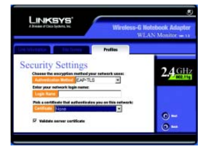
Figure 6-26: EAP-TLS Authentication

Click the Next button to continue. Click the Back button to return to the previous screen.