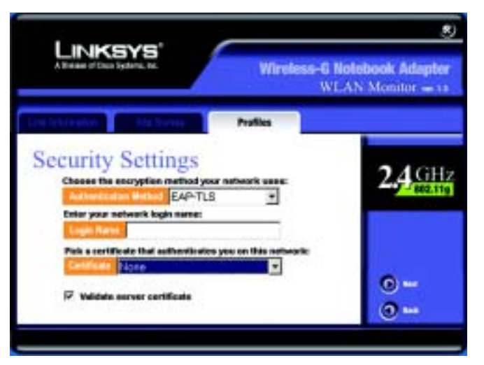
Figure 6-20: EAP-TLS Authentication

Click the Next button to continue. Click the Back button to return to the previous screen.