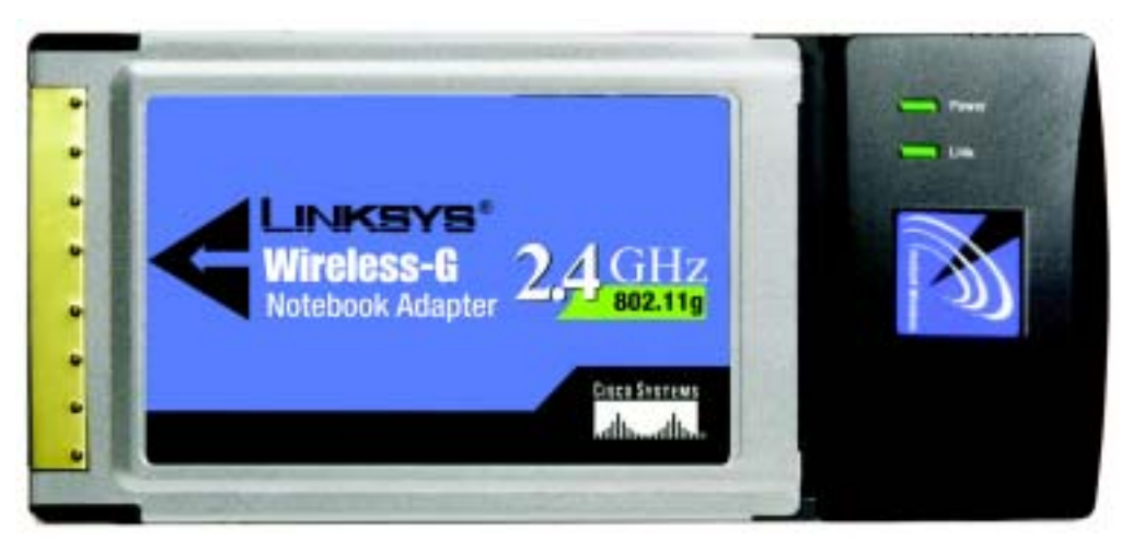
Figure 3-1: Front Panel

The Network Adapter's LEDs display information about network activity.