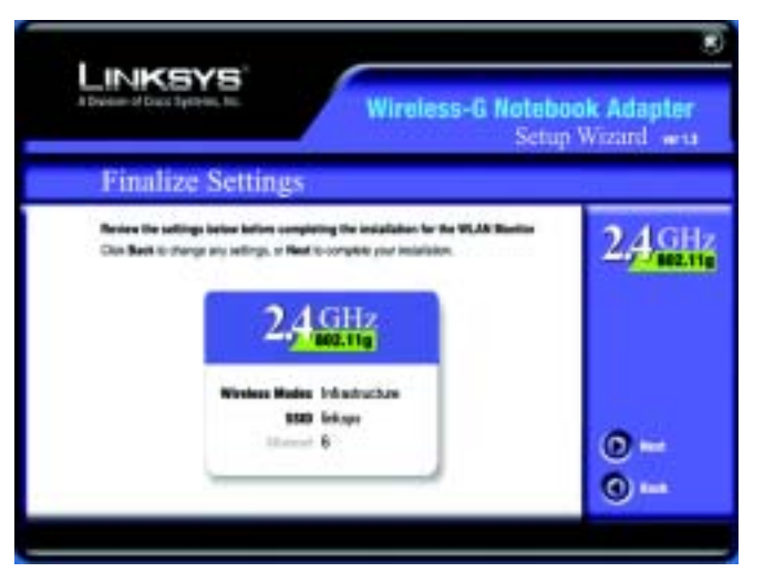
Figure 4-5: The Setup Wizard's Finalize Settings screen

If you're using Windows 2000, you may see a Windows Digital Signature warning. As this product has been tested to work with Windows, you may continue.