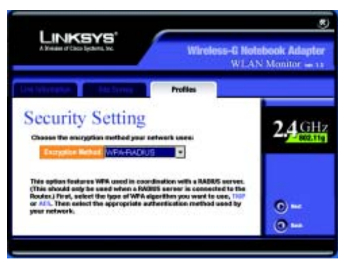
Figure 6-18: WPA RADIUS Settings

Click the Next button to continue and the screen in Figure 6-19 appears. Click the Back button to return to the previous screen.