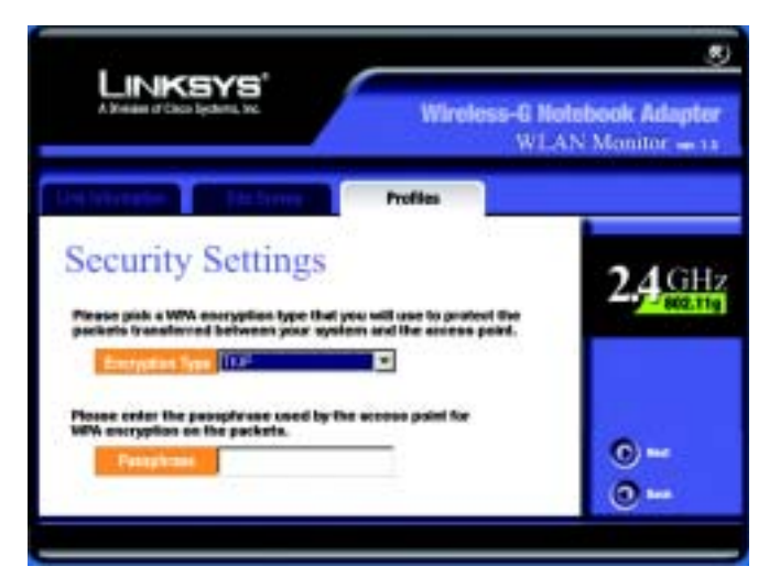
Figure 6-17: TKIP Settings

Select the type of algorithm, TKIP or AES , for the Encryption Type . Enter a WPA Shared Key of 8-63 characters in the Passphrase field.