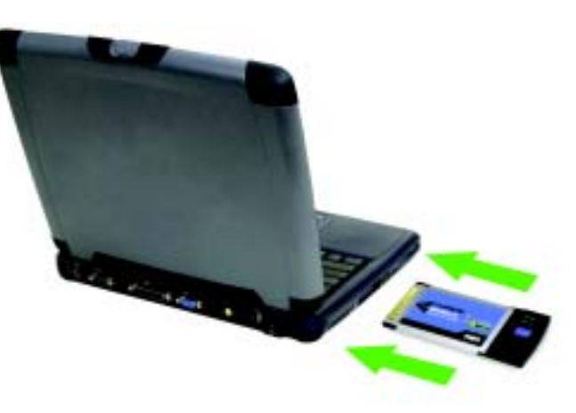
Figure 5-1: How the Adapter installs into your notebook

The installation of the Wireless-G Notebook Adapter is complete. If you want to check the link information, search for available wireless networks, or make additional configuration changes, go to "Chapter 6: Using the WLAN Monitor."