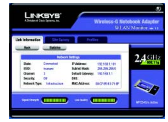
Figure 6-3: More Information-Network Settings

Click the X (Close) button in the upper right corner to exit the WLAN Monitor.