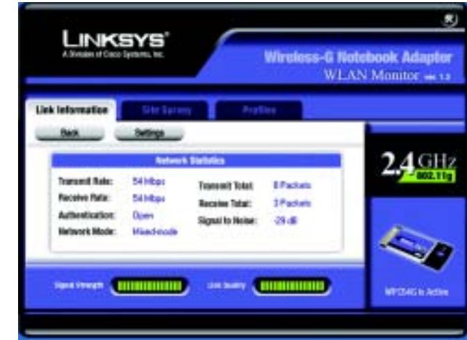
Figure 6-4: More Information-Network Statistics

Click the X (Close) button in the upper right corner to exit the WLAN Monitor.