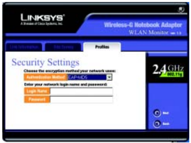
Figure 6-28: EAP-MD5 Authentication

Click the Next button to continue. Click the Back button to return to the previous screen.