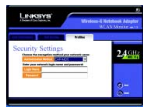
Figure 6-22: EAP-MD5 Authentication

Click the Next button to continue. Click the Back button to return to the previous screen.