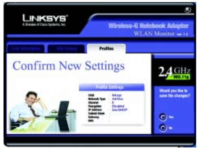
Figure 6-31: Confirm New Settings for New Profile

7. The Confirm New Settings screen will appear next showing the new settings. To save the new settings, click the Yes button. To edit the new settings, click the Back button.