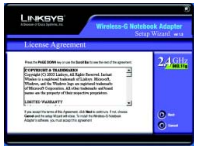
Figure 4-2: The Setup Wizard's License Agreement

3. The Setup Wizard will ask you to choose a network mode. Click the Infrastructure Mode radio button if you want your wireless computers to network with computers on your wired network using a wireless access point. Click the Ad-Hoc Mode radio button if you want multiple wireless computers to network directly with each other.