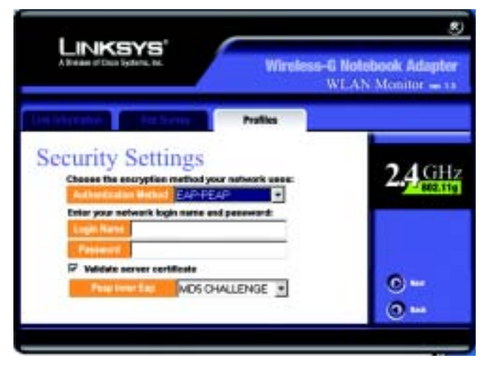
Figure 6-29: EAP-PEAP Authentication

Click the Next button to continue. Click the Back button to return to the previous screen.