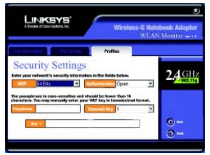
Figure 6-15: WEP Settings

Key 1 - The WEP key you enter must match the WEP key of your wireless network. If you are using 64-bit WEP encryption, then the key must consist of exactly 10 hexadecimal characters. If you are using 128-bit WEP encryption, then the key must consist of exactly 26 hexadecimal characters. Valid hexadecimal characters are "0" to "9" and "A" to "F".