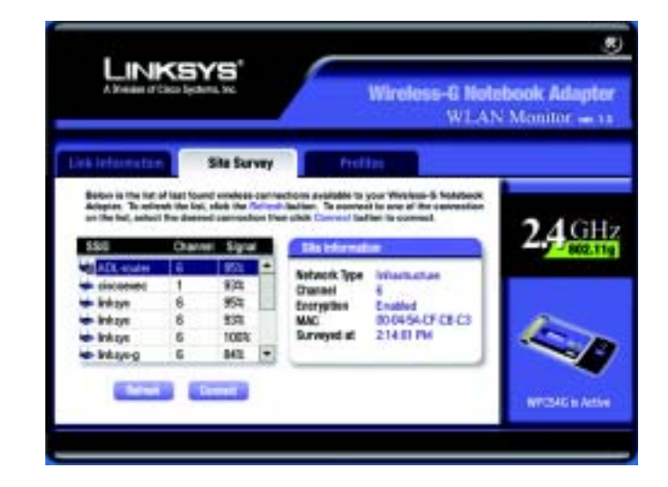
Figure 6-5: Site Survey

Click the X (Close) button in the upper right corner to exit the WLAN Monitor.