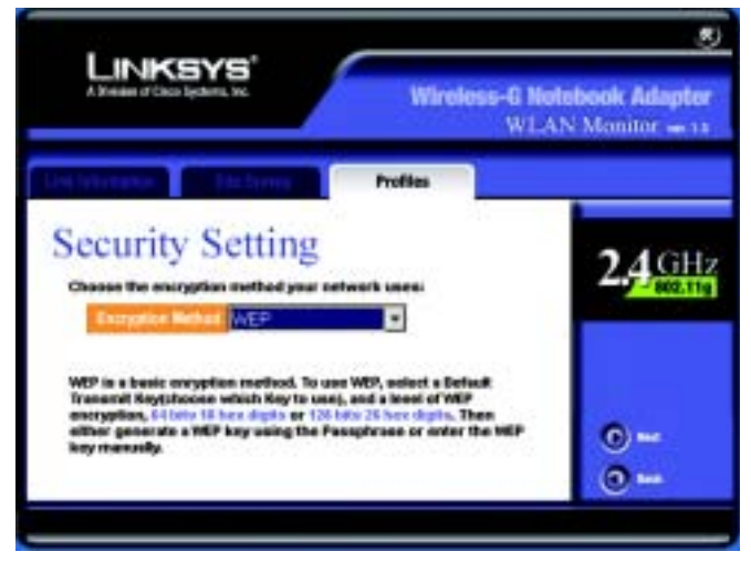
Figure 6-14: Security Setting for New Profile

Passphrase - Instead of manually entering a WEP key, you can enter a passphrase in the Passphrase field, so a WEP key is automatically generated. It is case-sensitive and should not be longer than 16 alphanumeric characters. This passphrase must match the passphrase of your other wireless network devices and is compatible with Linksys wireless products only. (If you have any non-Linksys wireless products, enter the WEP key manually on those products.)