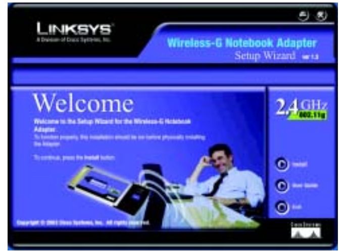
Figure 4-1: The Setup Wizard's Welcome screen

Exit - Click the Exit button to exit the Setup Wizard.