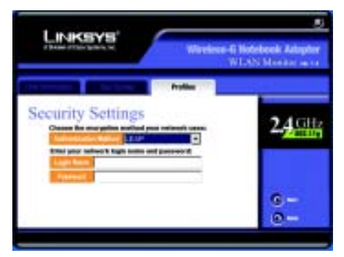
Figure 6-24: EAP-LEAP Authentication

Chapter 6: Using the WLAN Monitor Creating a New Profile