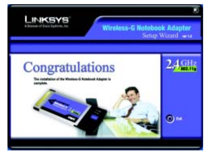
Figure 4-6: The Setup Wizard's Congratulations Screen

Proceed to "Chapter 5: Hardware Installation."