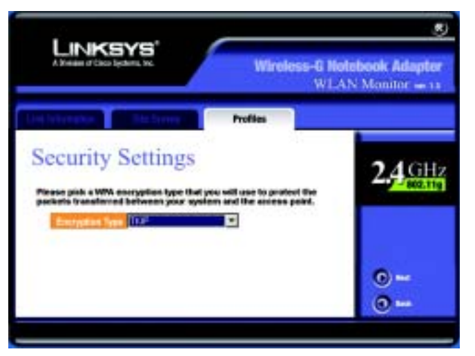
Figure 6-19: TKIP Settings

Click the Next button to continue. Click the Back button to return to the previous screen.