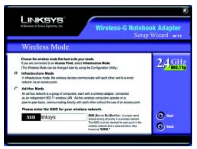
Figure 4-3: The Setup Wizard's Network Mode screen

NOTE: Network SSIDs should be unique to your network and identical for all devices within the network.