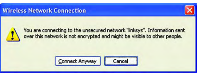
Figure B-5: No Wireless Security

3. If your network does not have wireless security enabled, click the Connect Anyway button to connect the Adapter to your network.