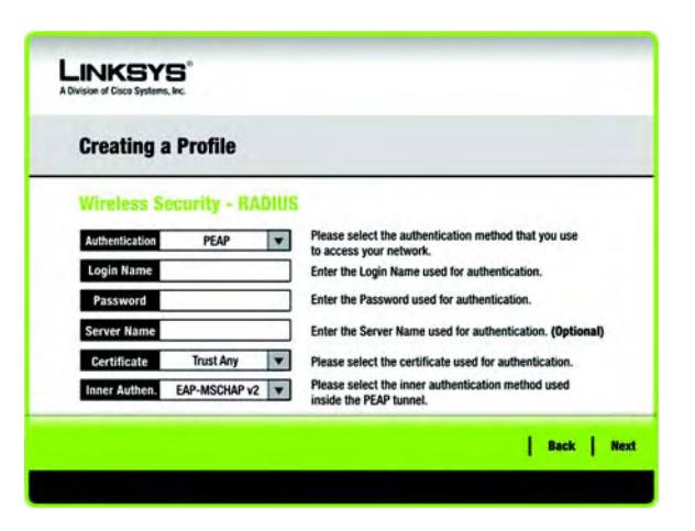
Figure 5-27: Wireless Security - RADIUS - PEAP

Click the Next button to continue or the Back button to return to the previous screen.