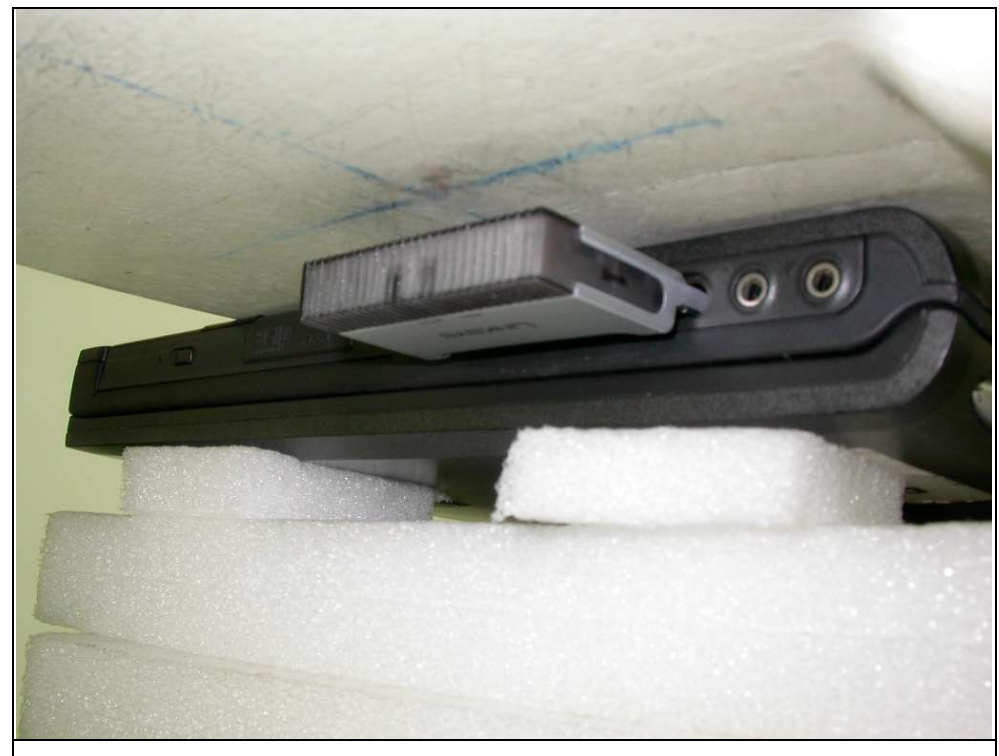
A: NOTEBOOK MODEL: N800C

The following test configurations have been applied in this test report: