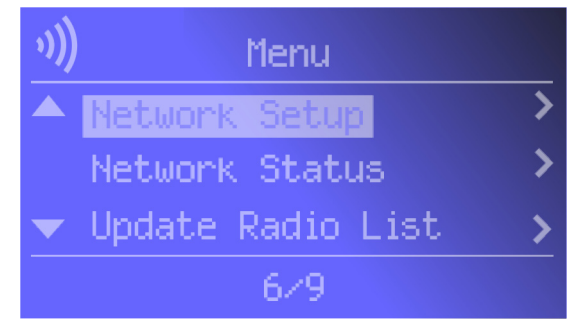
Figure 5-12: Main Menu Screen

If you want to change the Media Link's Device Name, select Device Name . Use the arrow keys to scroll through the uppercase alphabet, lowercase alphabet, numbers, and punctuation. To make a selection, press the Select button. Press the right arrow button to save your new setting. Press the left arrow button to cancel your change.