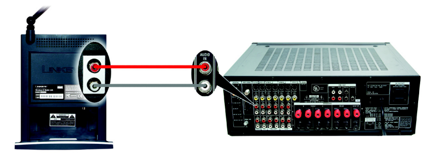
Figure 5-7: Connecting the RCA Cable to Your Stereo

5. If you want to connect the Media Link to your stereo's RCA input, connect the color-coded RCA cable to the Media Link's 2 CH Output (left and right) ports. Then connect the other end to your stereo's RCA input.