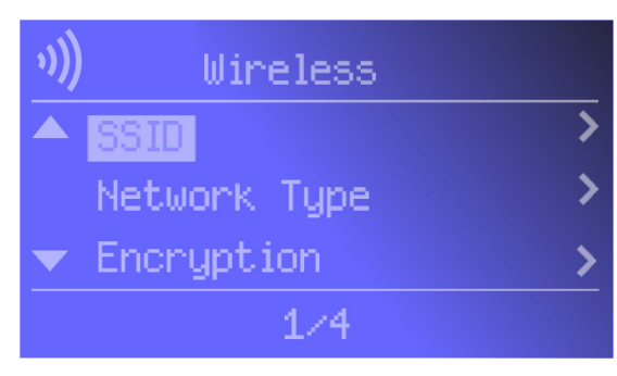
Figure 5-14: Wireless Screen

If you want to change the wireless network type, select Network Type . If your network uses infrastructure mode, then select Infrastructure . If your network uses ad-hoc mode, then select Ad-Hoc . Your selection will be denoted by a bracketed asterisk, [*]. Press the right arrow button to save your new setting. Press the left arrow button to cancel your change.