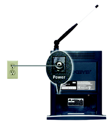
Figure 5-9: Connect the Power

If you have already set up the Media Link using the Setup Wizard, then proceed to "Chapter 6: Using the LCD Menus of the Wireless-B Media Link for Music."