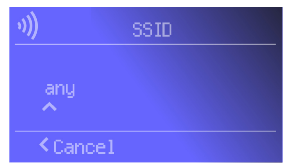
Figure 5-15: SSID Screen