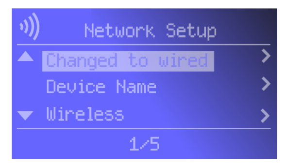
Figure 5-13: Network Setup Screen