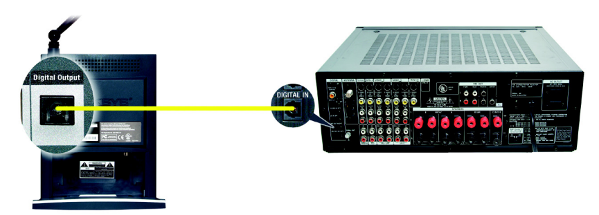
Figure 5-8: Connecting the Optical Cable to Your Stereo

NOTE: If you have already connected the Media Link to its speakers and you also want to connect it to your stereo, then you must use the Media Link's Digital Output port for connection to your stereo.