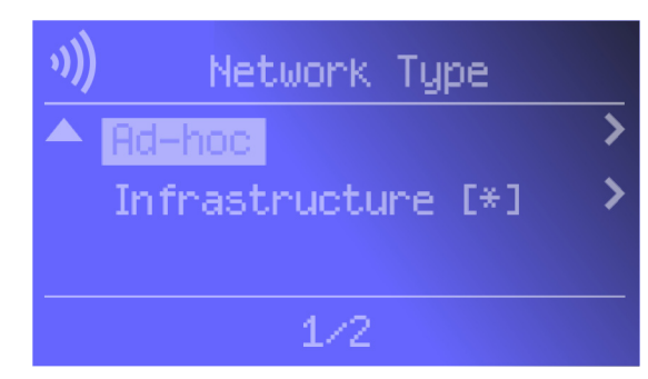
Figure 5-16: Network Type Screen

Ad-hoc: a group of wireless devices communicating directly with each other (peerto-peer) without the use of an access point.