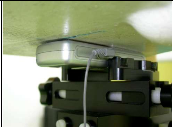
The front of the EUT to the flat phantom distance 0mm.