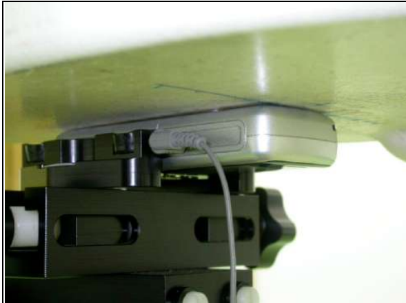
The bottom of the EUT to the flat phantom distance 0mm.