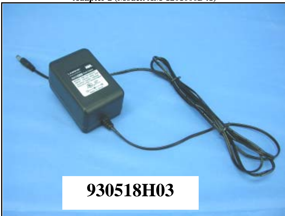
Adapter 2 (Model: AM-1201000D41)