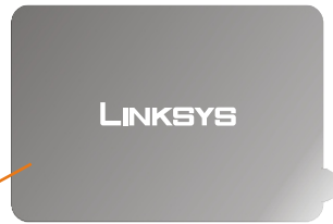
LCD Protect film Semi-transparent - cool gray 10C (24)