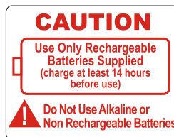
(11) Battery Charging Sticker