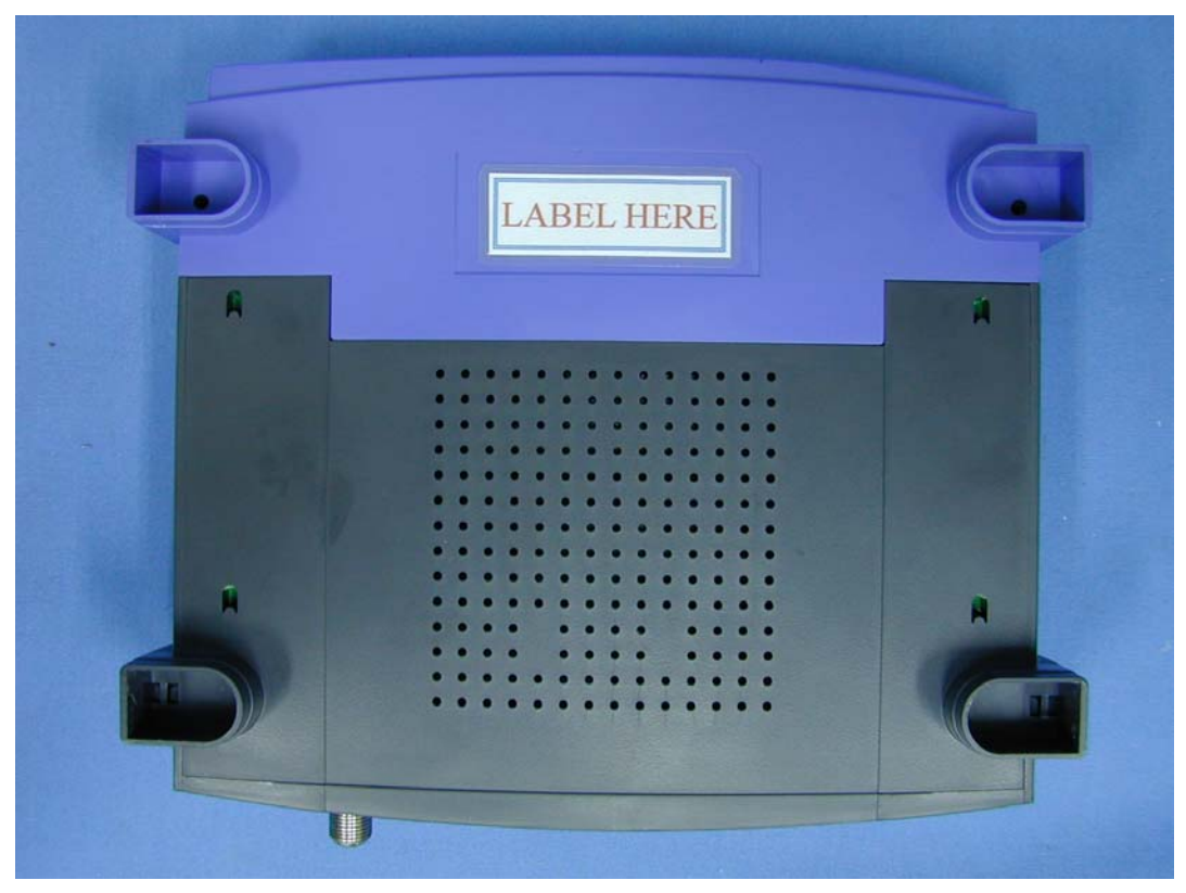
The FCC ID and DoC Label will be placed on the equipment as shown in the photograph below.