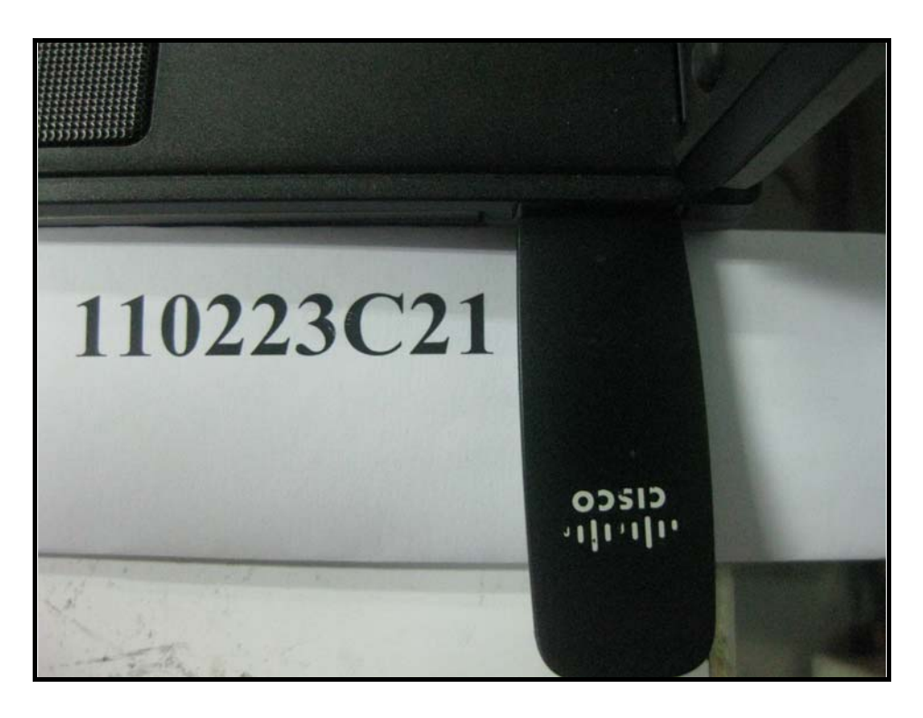
RADIATED EMISSION TEST