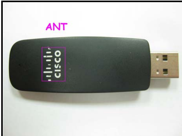
DESCRIPTION OF ANTENNA LOCATION