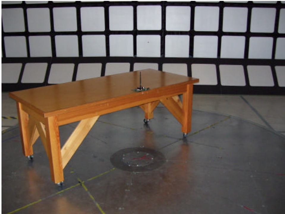
Figure 14 Radio module as tested on evaluation board