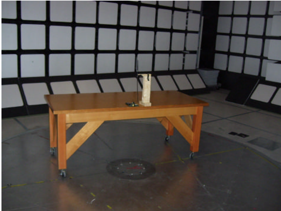
Figure 16 Testing with RF cable and antenna