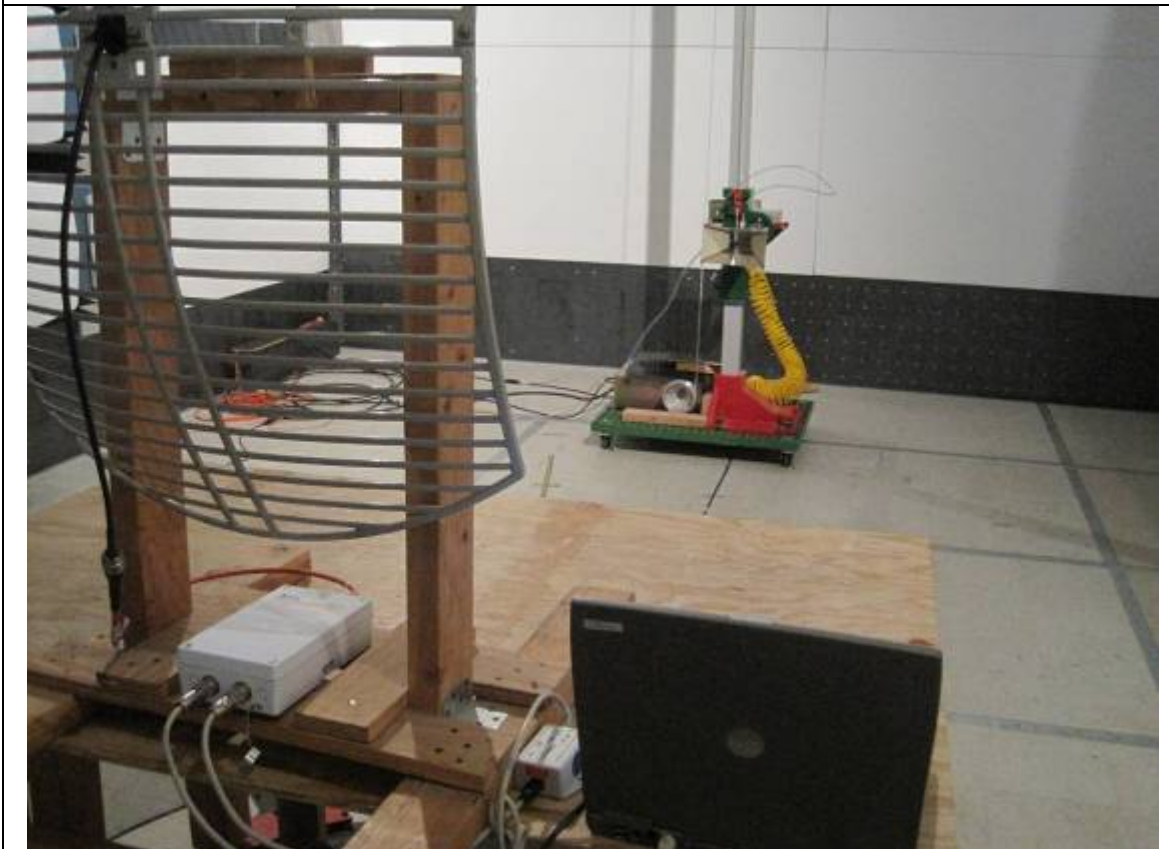
Radiated Emission Test Setup(15dBi Antenna) – Rear View