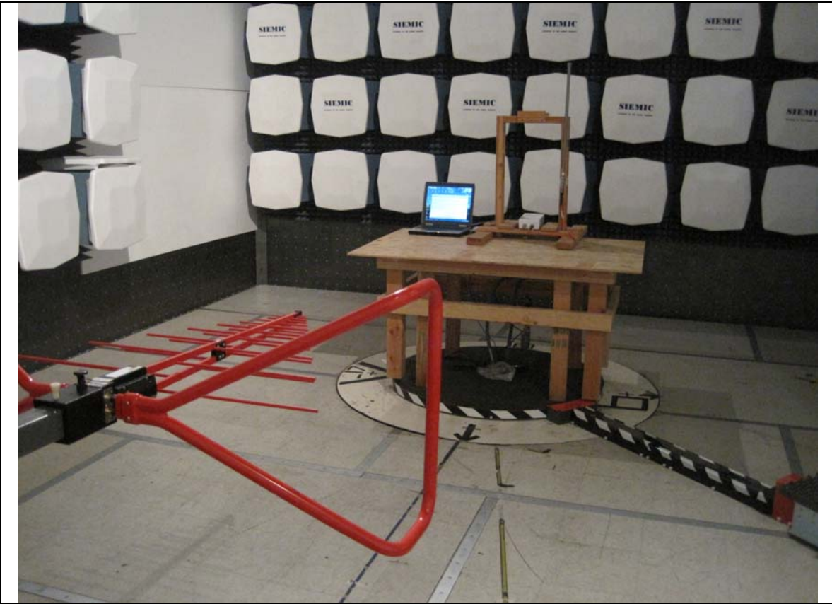
Radiated Emission Test Setup(5dBi Antenna) – Front View