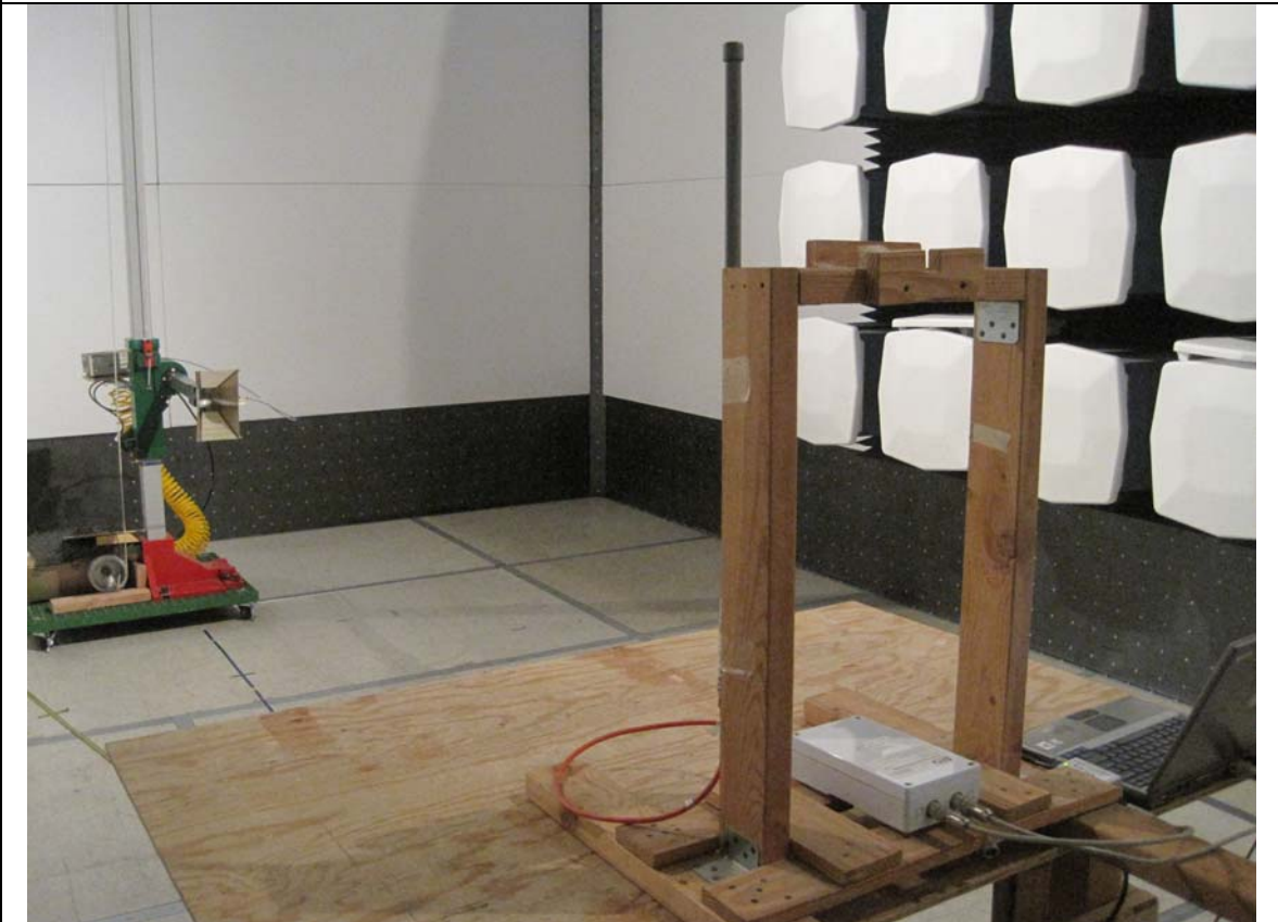
Radiated Emission Test Setup(5dBi Antenna) – Rear View