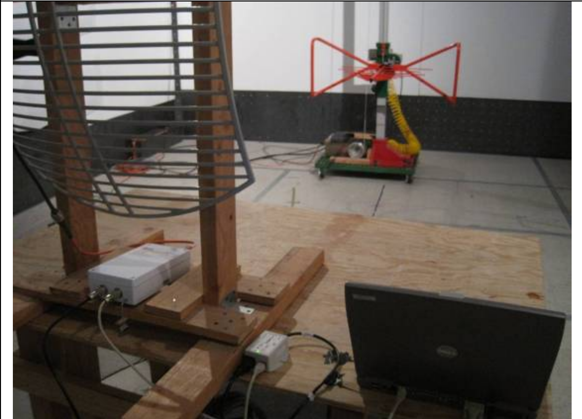
Radiated Emission Test Setup(15dBi Antenna) – Rear View