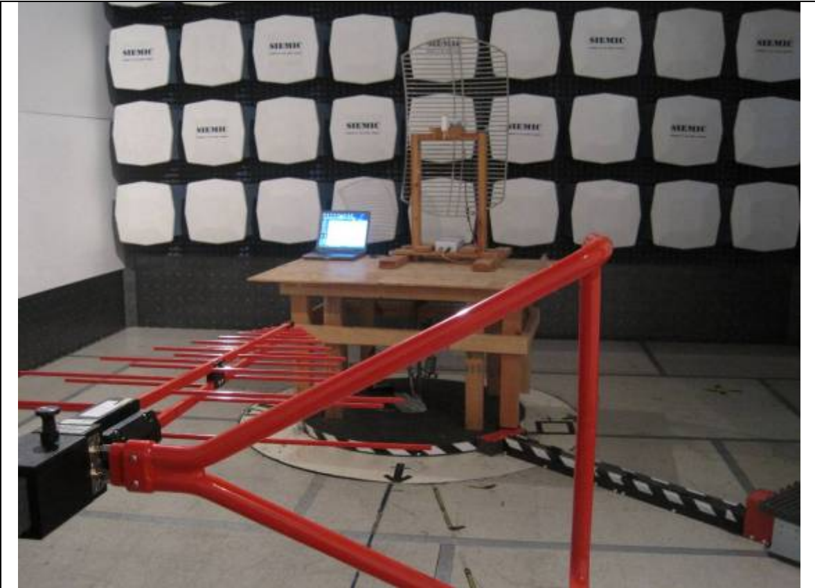
Radiated Emission Test Setup (15dBi Antenna) - Front View