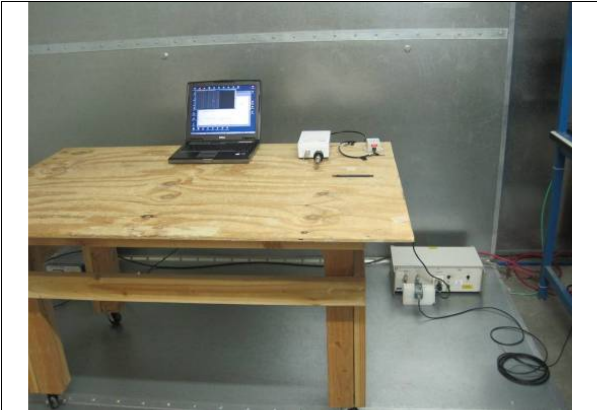
Conducted Emission Test Setup – Front View