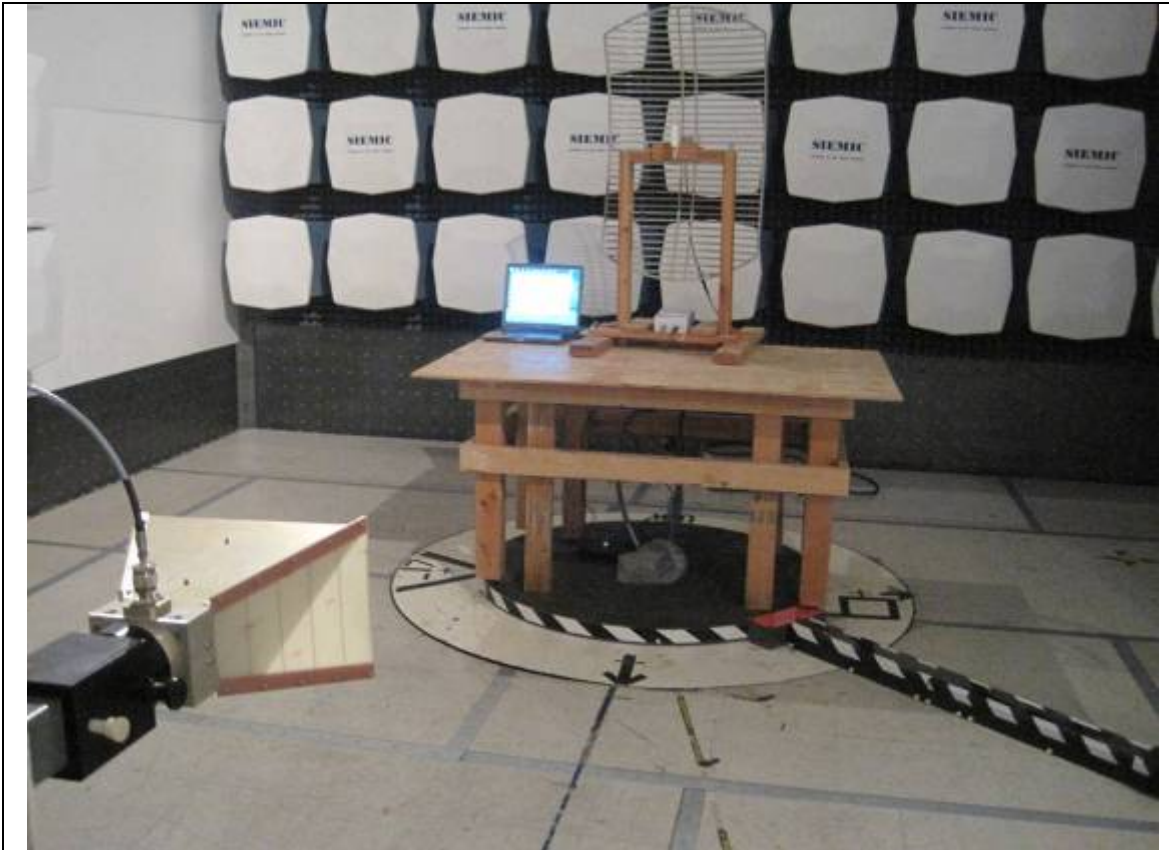
Radiated Emission Test Setup(15dBi Antenna) – Front View