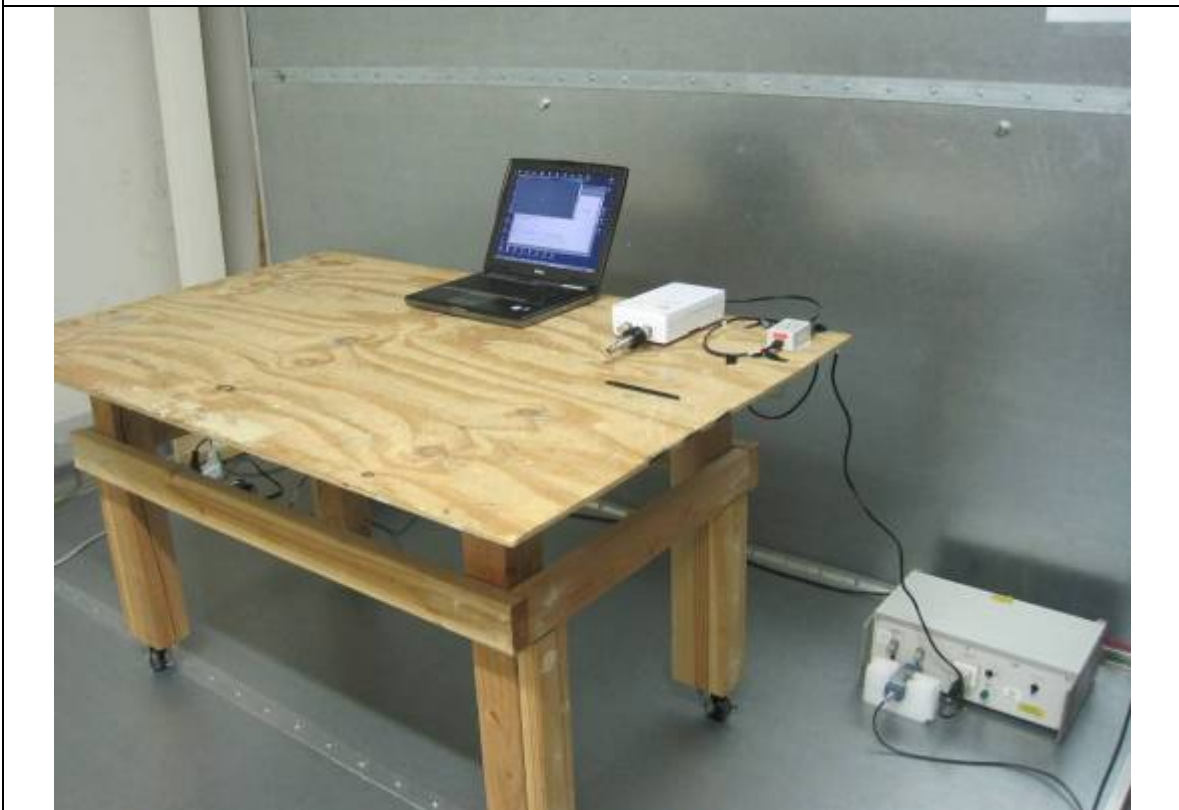
Conducted Emission Test Setup – Rear View