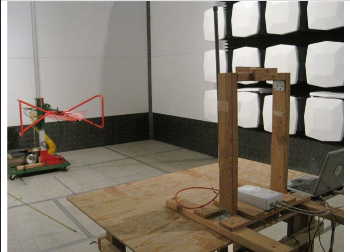
Radiated Emission Test Setup(5dBi Antenna) – Rear View