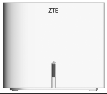
Figure 3-1 The Front Panel