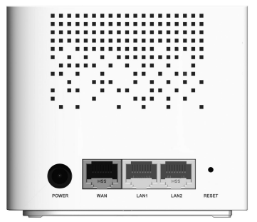
Figure 3-2 The Rear Panel

Figure 3-2 shows the interfaces and buttons on the rear panel of the ZXHN H196A