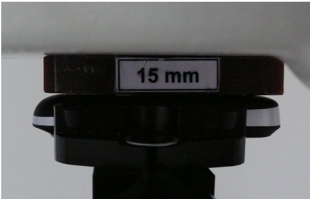
Picture 13: Body, The EUT display towards ground, the distance from handset to the bottom of the Phantom is 15mm (The spacer was removed during testing)