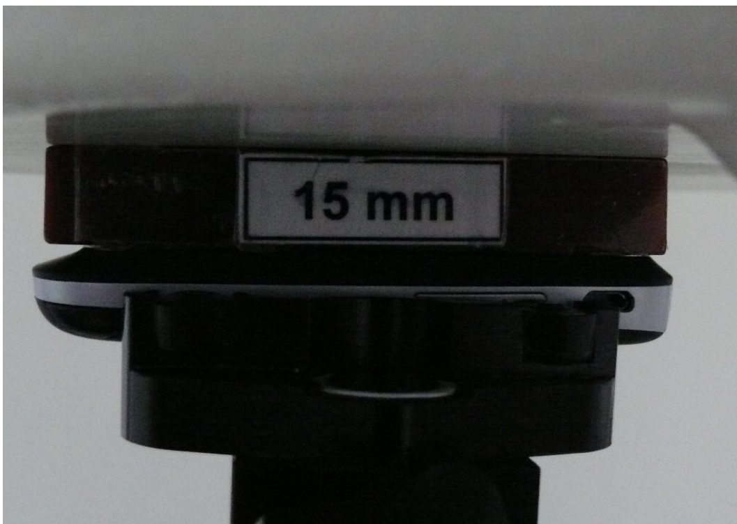
Picture 14: Body, The EUT display towards phantom, the distance from handset to the bottom of the Phantom is 15mm(The spacer was removed during testing)