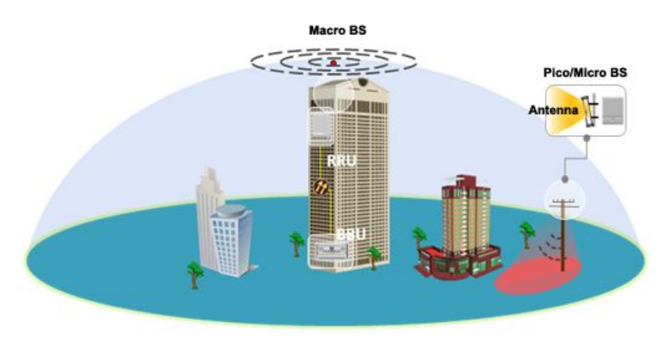
Figure 3-1 Coverage Holes and Weak Spots of Macro BSs