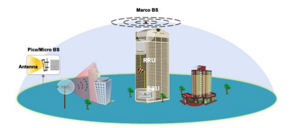
Figure 3-2 Outdoor Penetration and Indoor Coverage