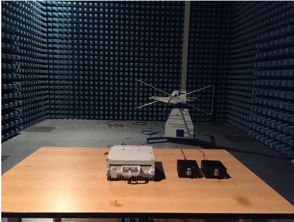
Radiated spurious emission below 1GHz