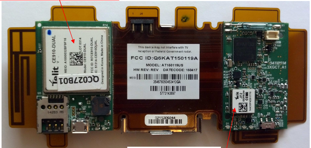
JF2 module with the shield removed

For detailed internal view of the module, see: FCC ID: RI7CE910DUAL