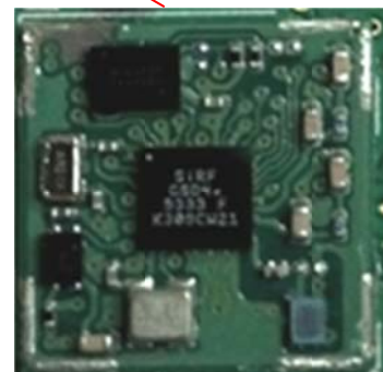
JF2 module with the shield removed

For detailed internal view of the module, see: FCC ID: RI7UE910NA IC ID: 5131A-UE910NA