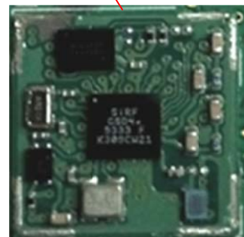
JF2 module with the shield removed