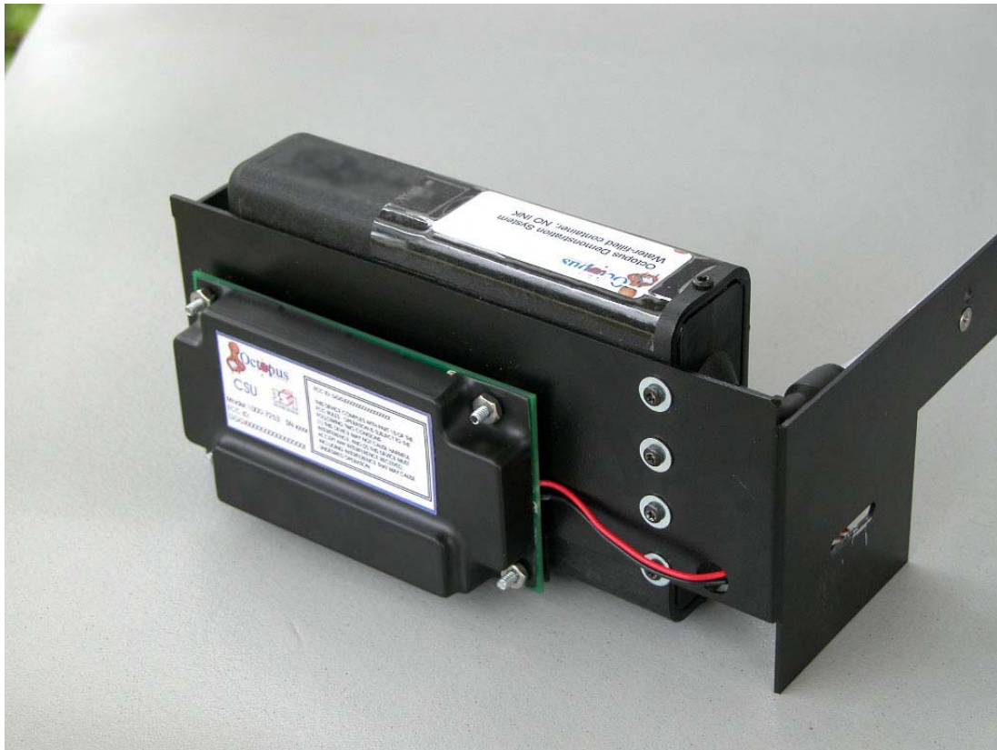
Figure 2: CSU Unit with Sample Label