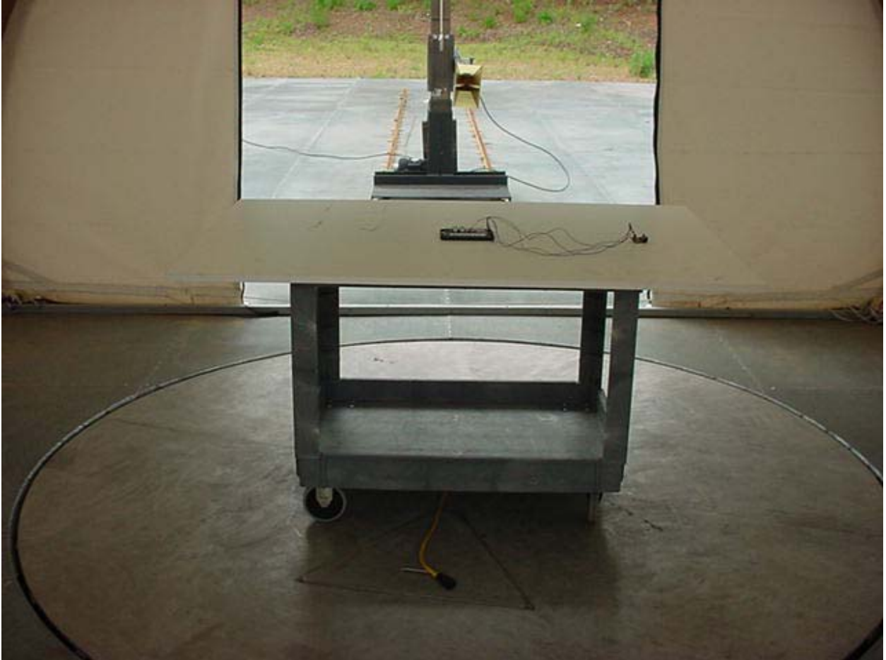
Figure 4: Spurious Emissions – Rear View