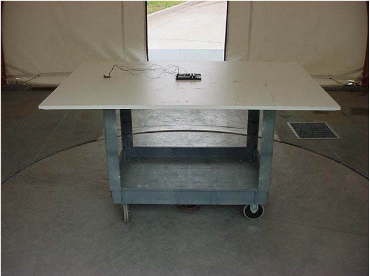
Figure 3: Spurious Emissions – Front View