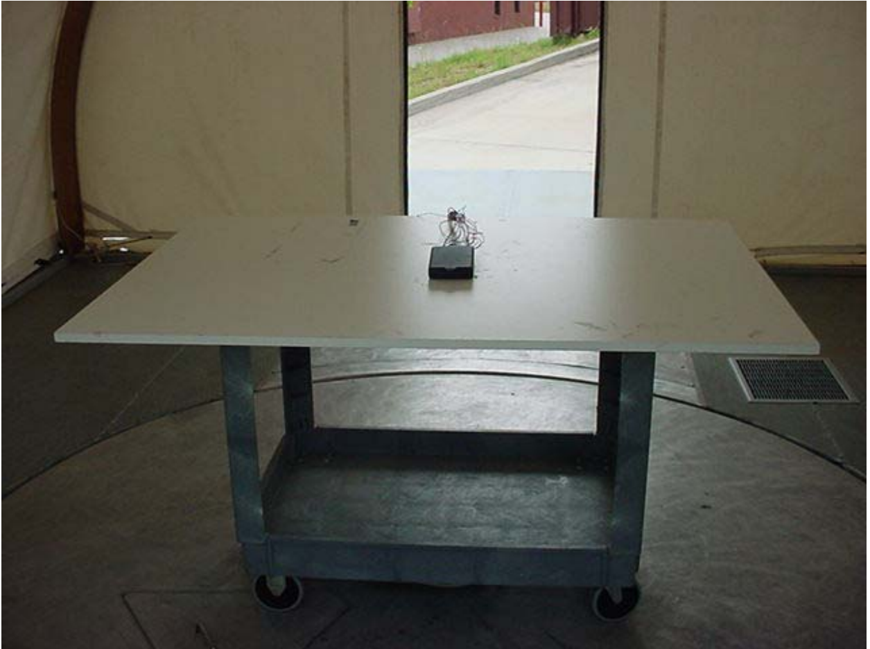
Figure 1: Unintentional Radiated Emissions – Front View