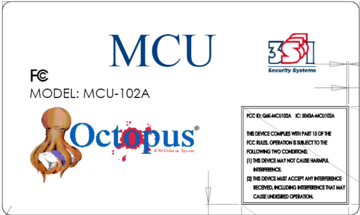
Figure 1: Sample Label