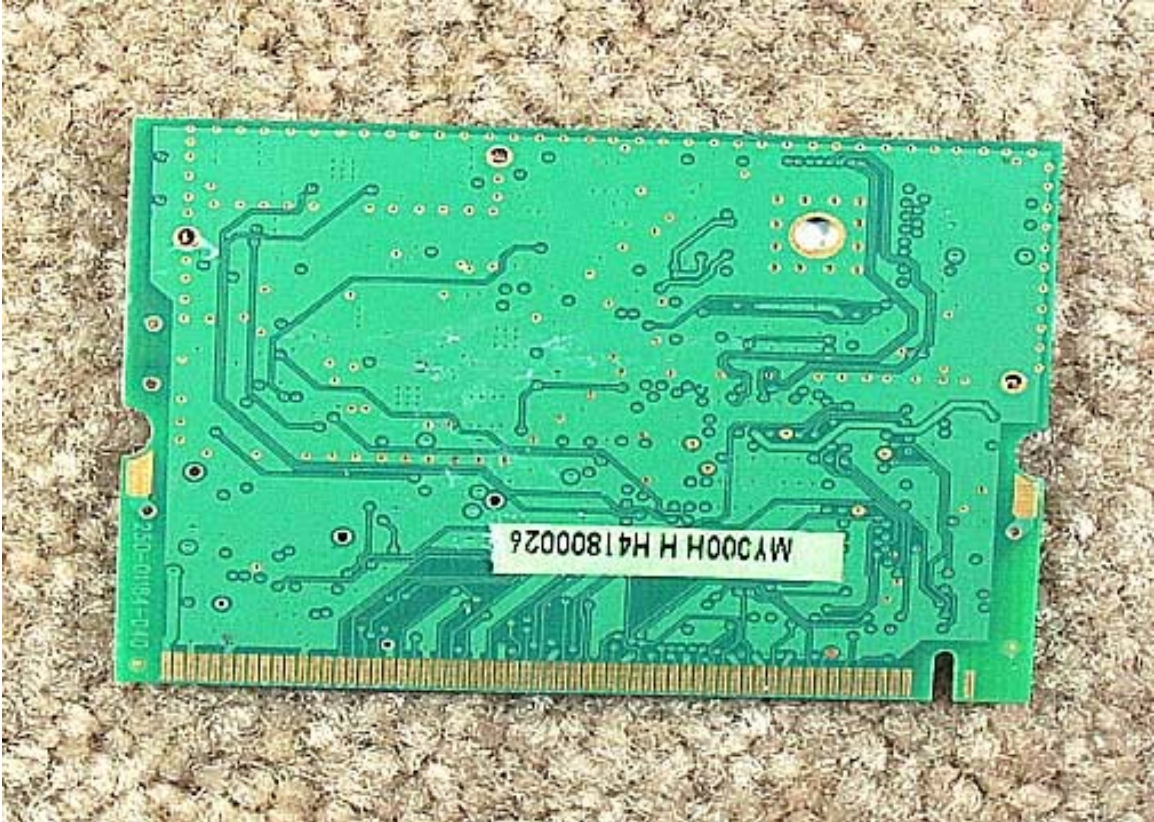
Transmitter PCB Bottom