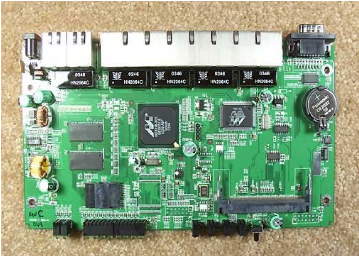
Main PCB Top