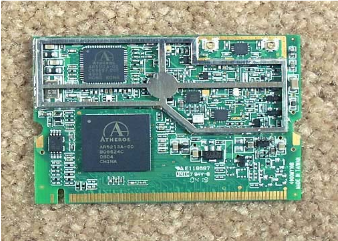
Transmitter PCB Top without Shield