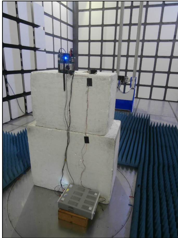
Figure 2 – Radiated Spurious Emissions - 1 GHz to 18 GHz