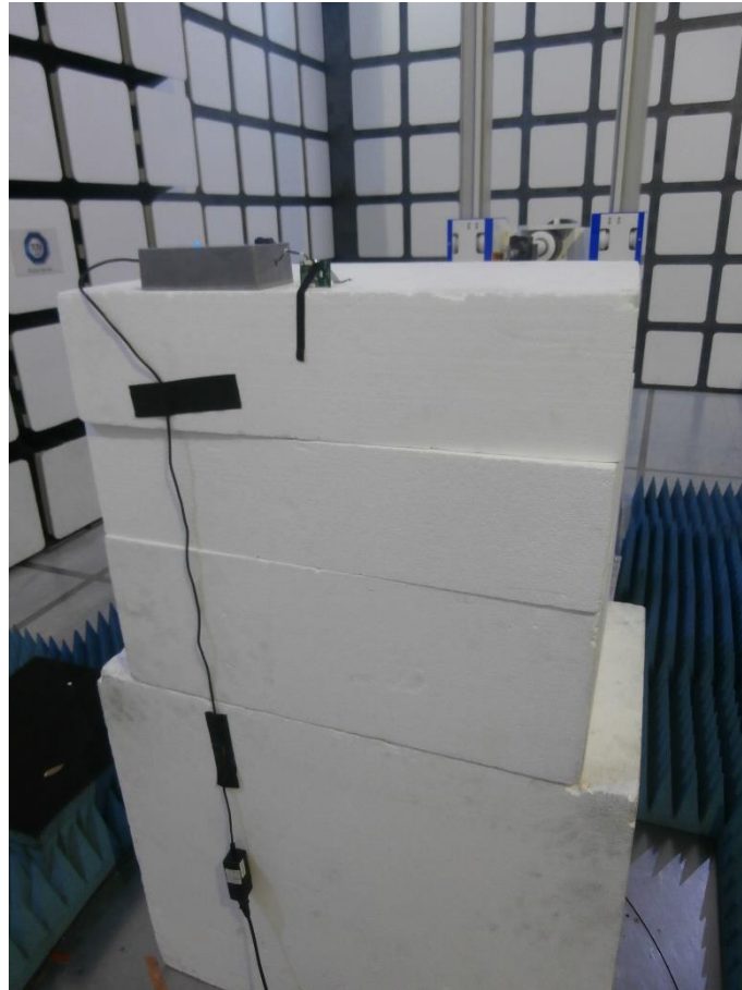
Radiated Emissions 18 GHz to 25 GHz