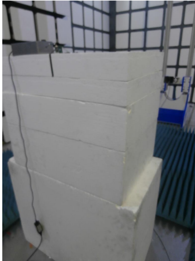
Radiated Emissions 1 GHz to 3 GHz