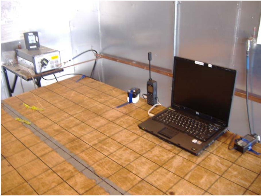
AC Powerline Conduction