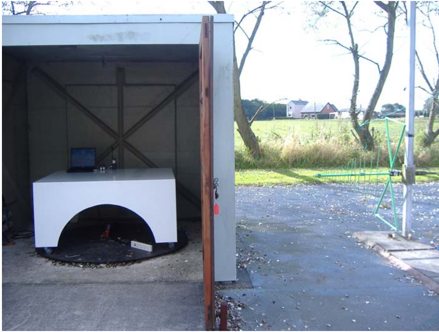
EUT On open Area Test Site