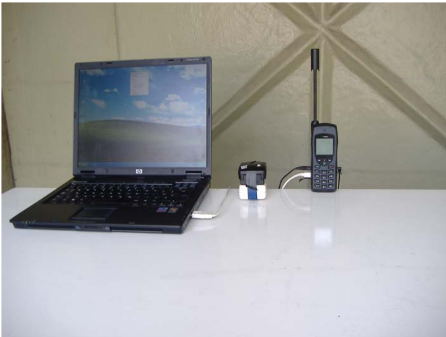
Close Up Of EUT On Open Area Test Site