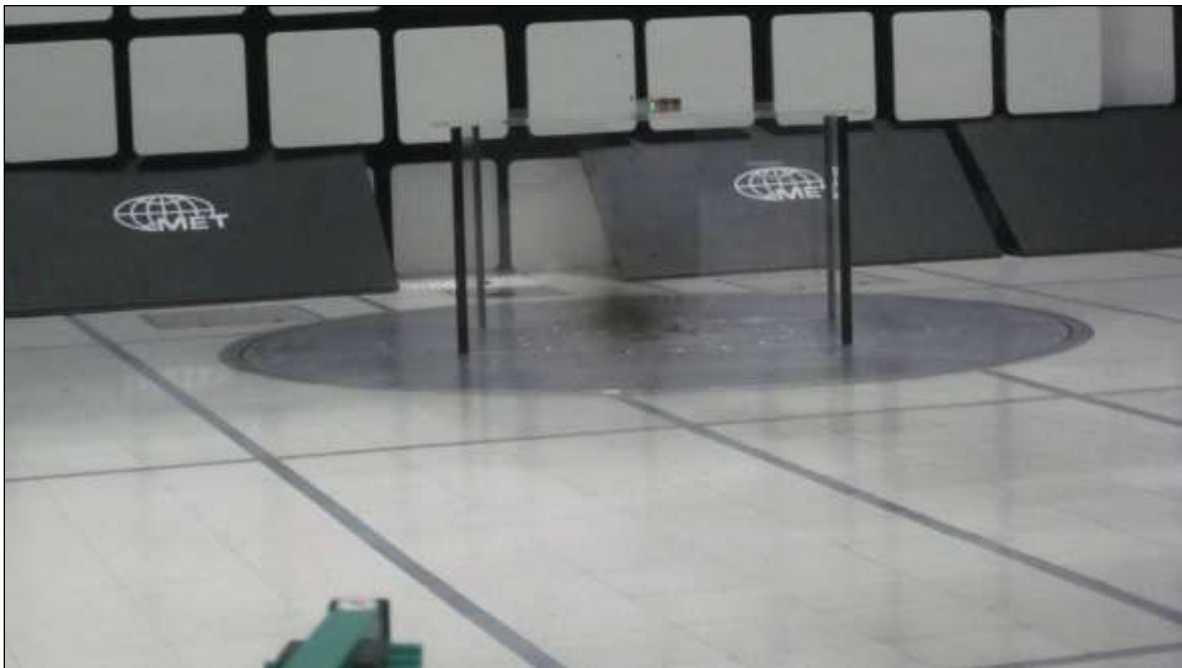
Photograph 2. Radiated Spurious Emissions, Test Setup, Below 1 GHz