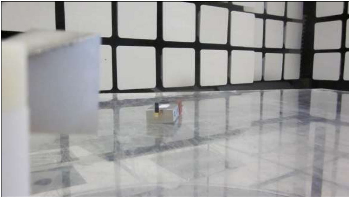
Photograph 4. Radiated Spurious Emissions, Test Setup, 18 GHz – 26 GHz