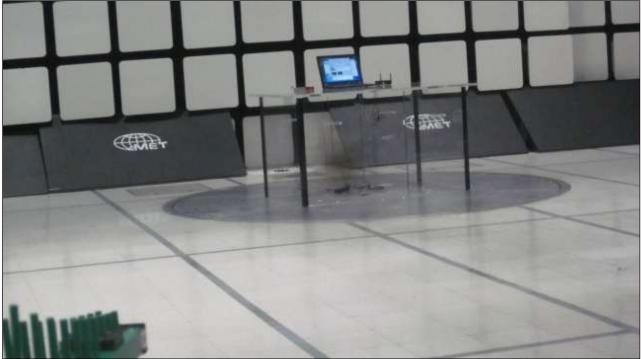
Photograph 1. Radiated Emission, Test Setup