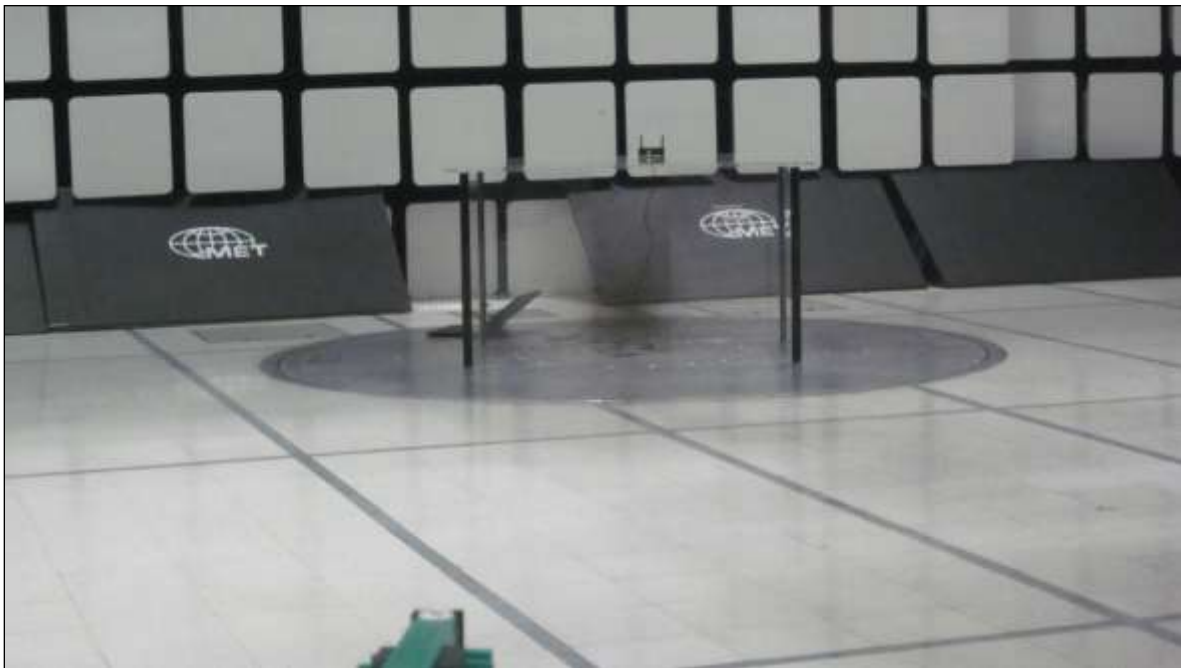
Photograph 2. Radiated Spurious Emissions, Test Setup, Below 1 GHz