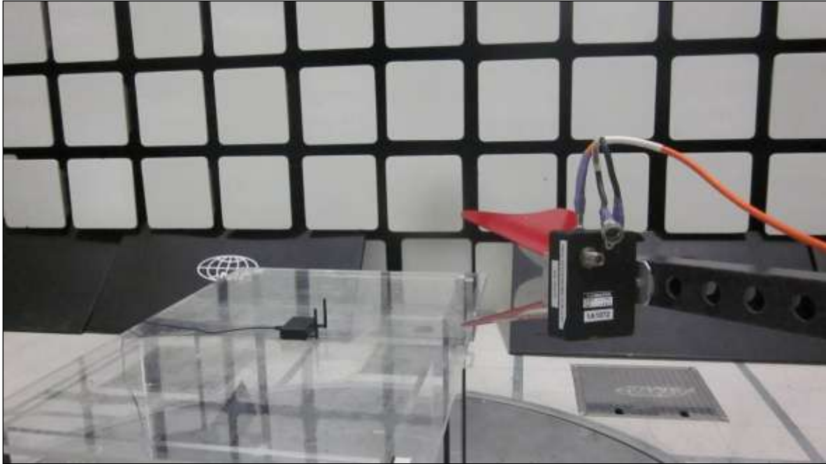
Photograph 3. Radiated Spurious Emissions, Test Setup, 1 GHz – 18 GHz