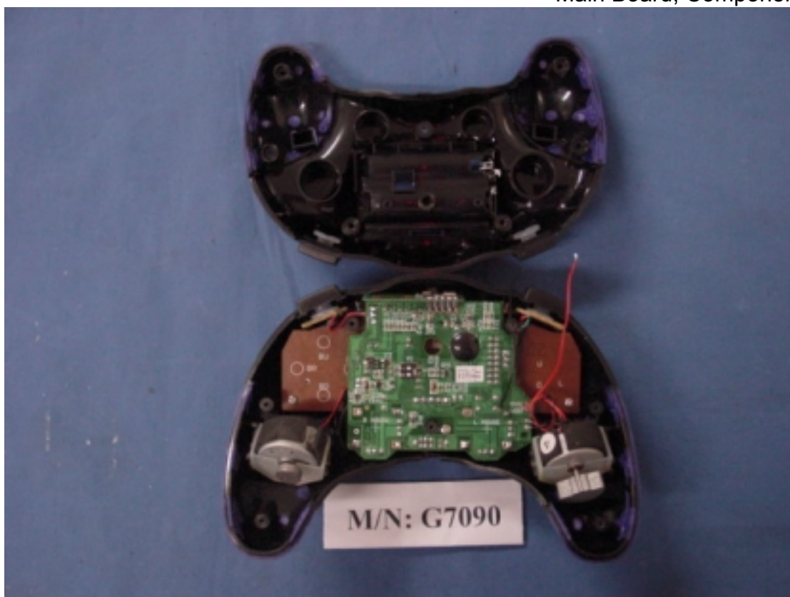
Figure 12 Main Board, Component Side