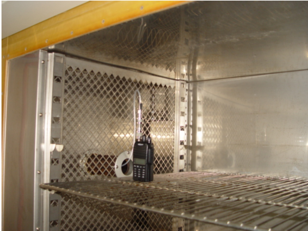
Photo 4 Transient frequency behavior Test