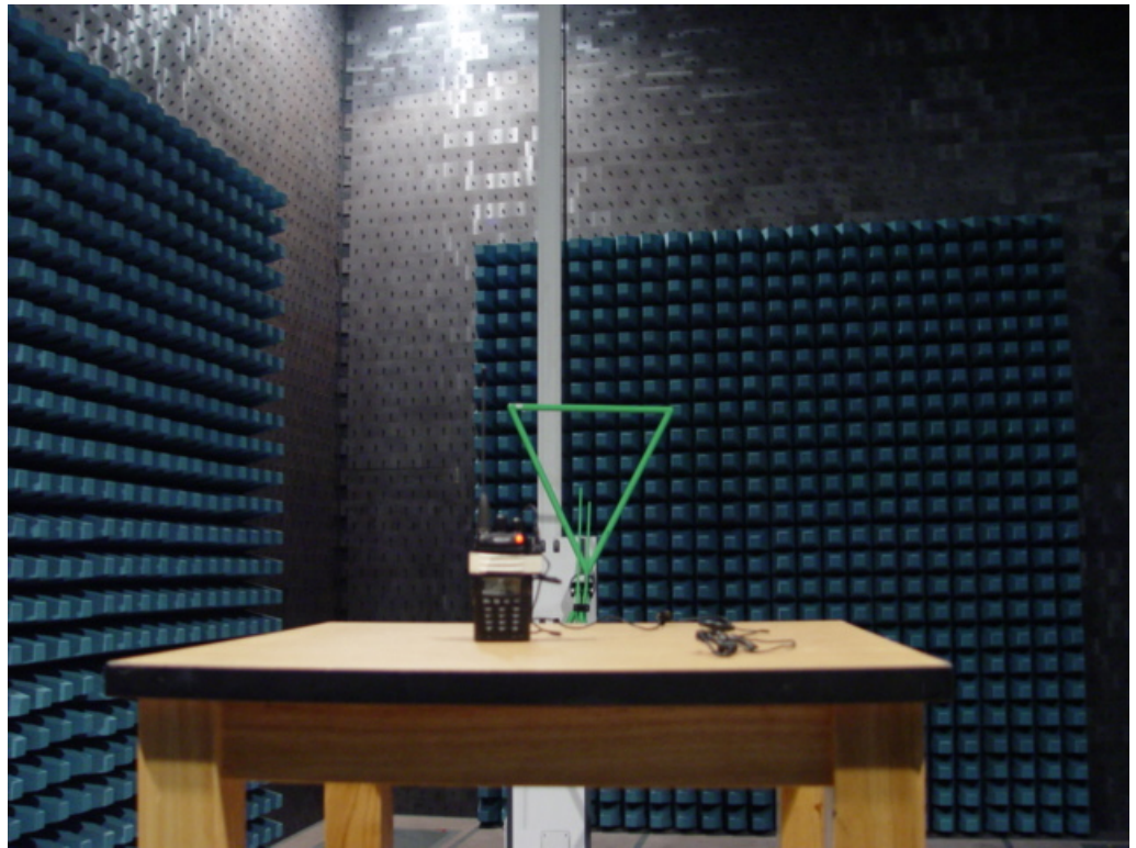
Photo 2 Radiated Spurious Emission Disturbance Test