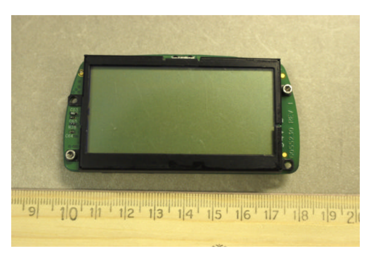
Front of Handheld Programmer Circuit Board