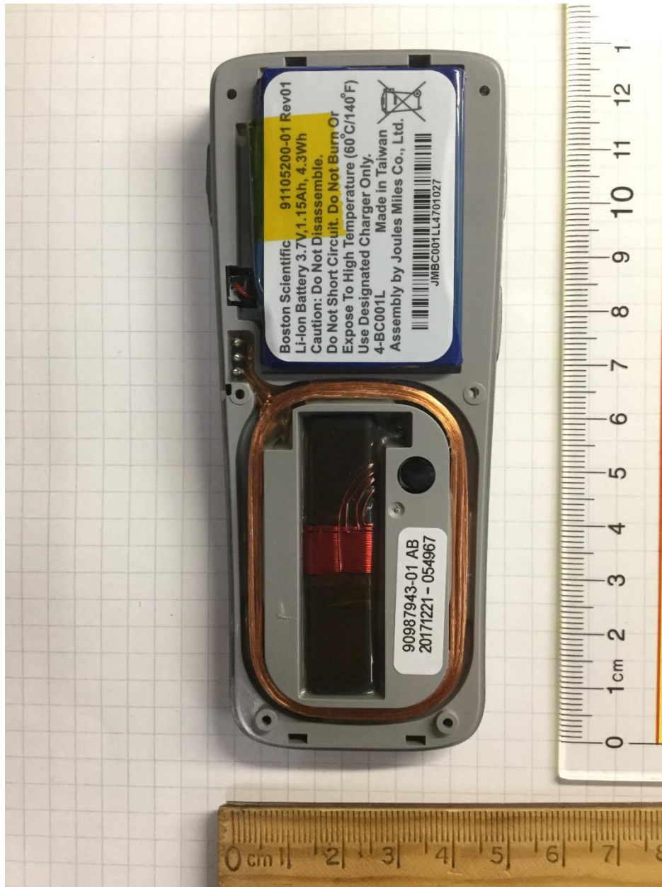
Figure 3: RC5 Internal Photo – Backside