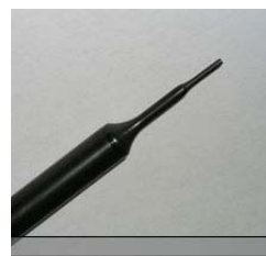
Interior of probe