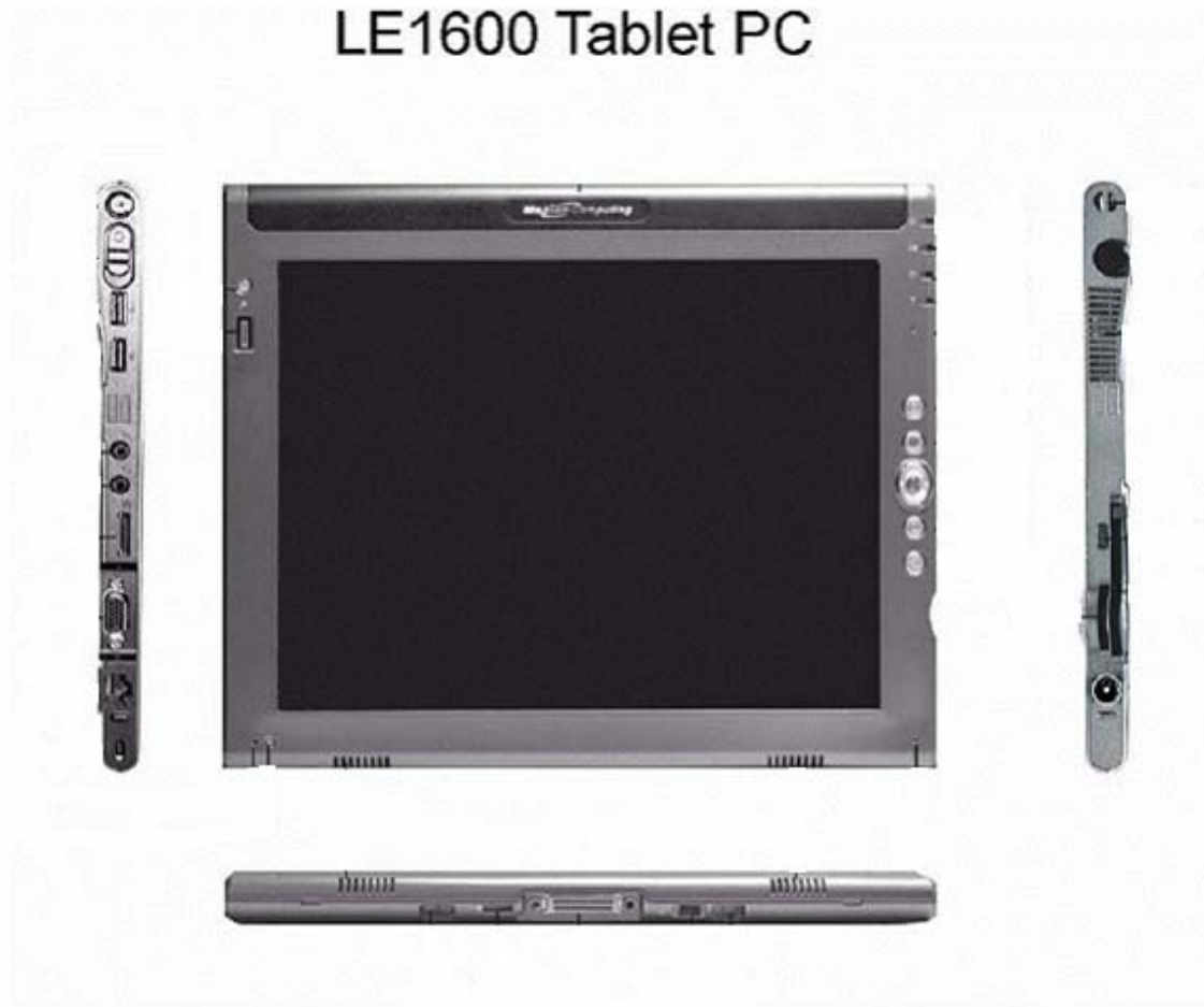
Figure 1: Tablet PC