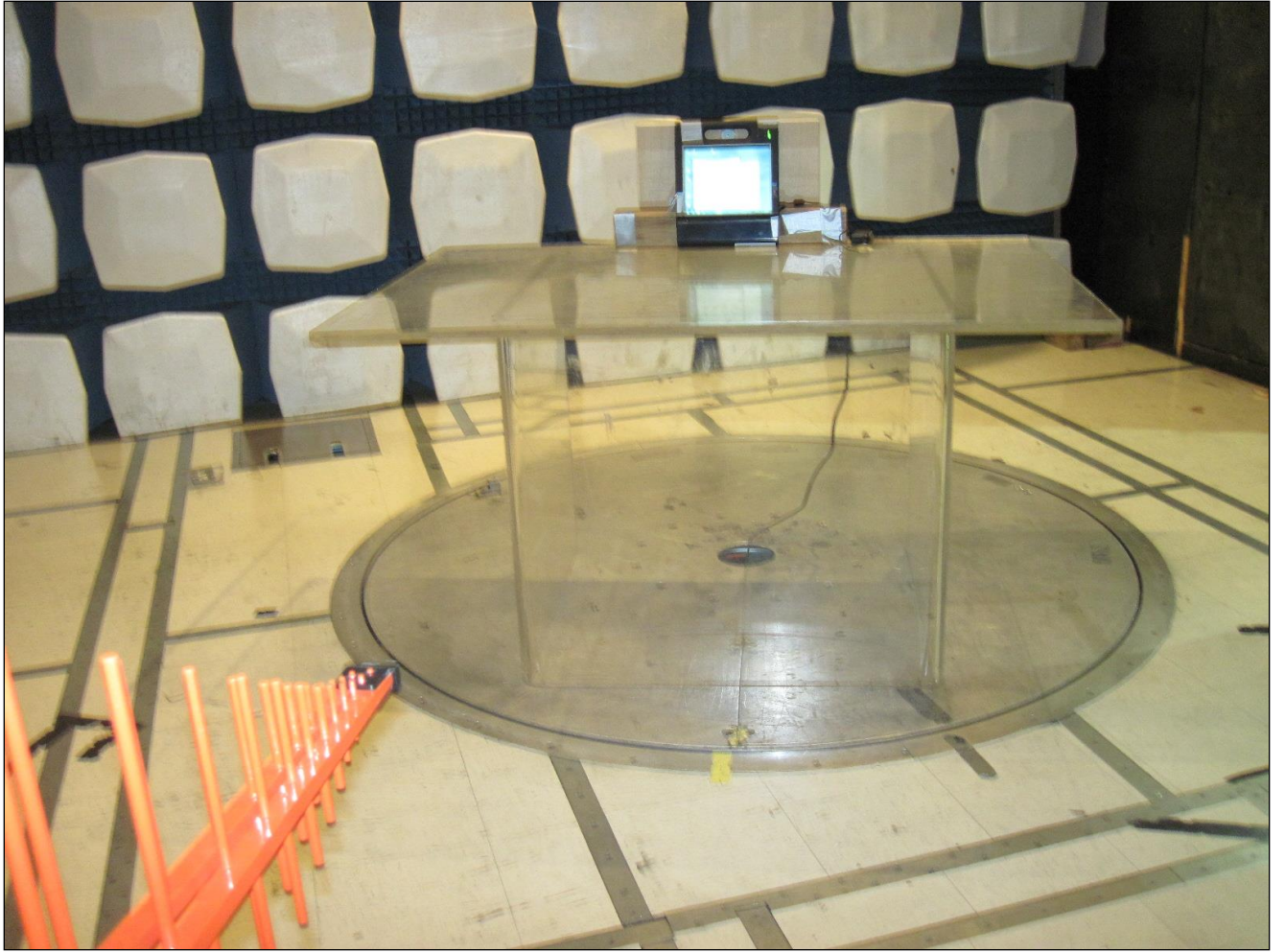
Photograph 2. Radiated Emissions, Test Setup