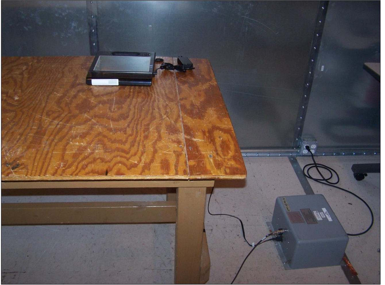
Photograph 3. Conducted Emissions, 15.207(a), Test Setup