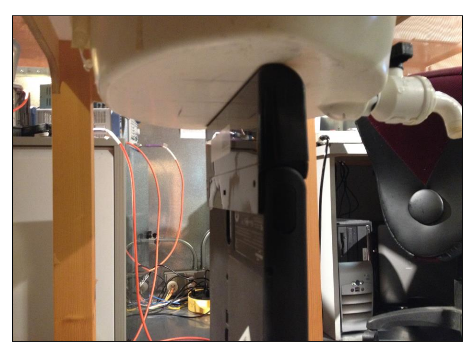
Photograph 2. Bottom Edge of the Unit against Phantom