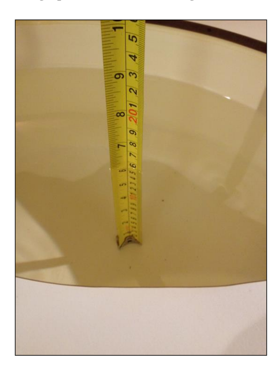
Photograph 6. Fluid Depth