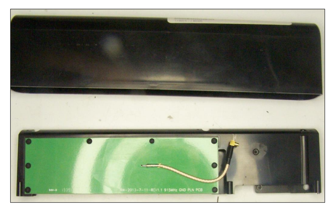
Photograph 7. Integral Antenna Element