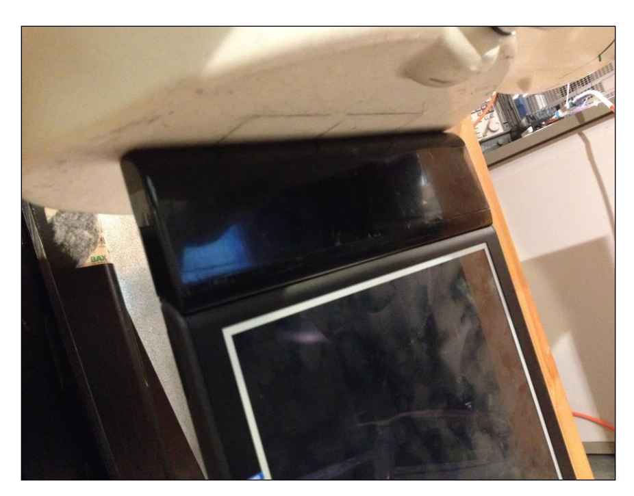
Photograph 3. Bottom Edge of the Unit against Phantom