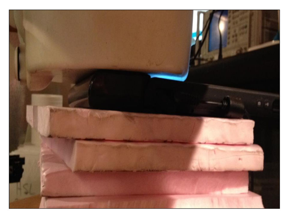
Photograph 4. Face of the Unit against Phantom