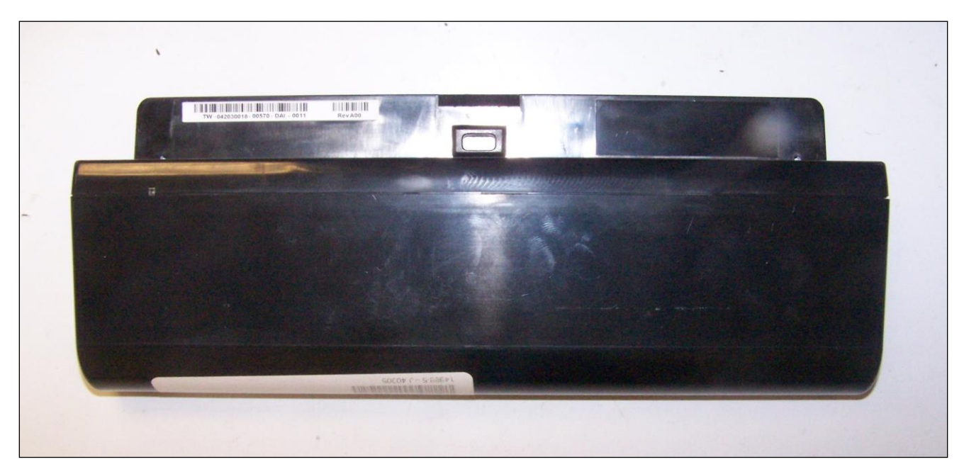
Photograph 6. EUT Antenna Housing