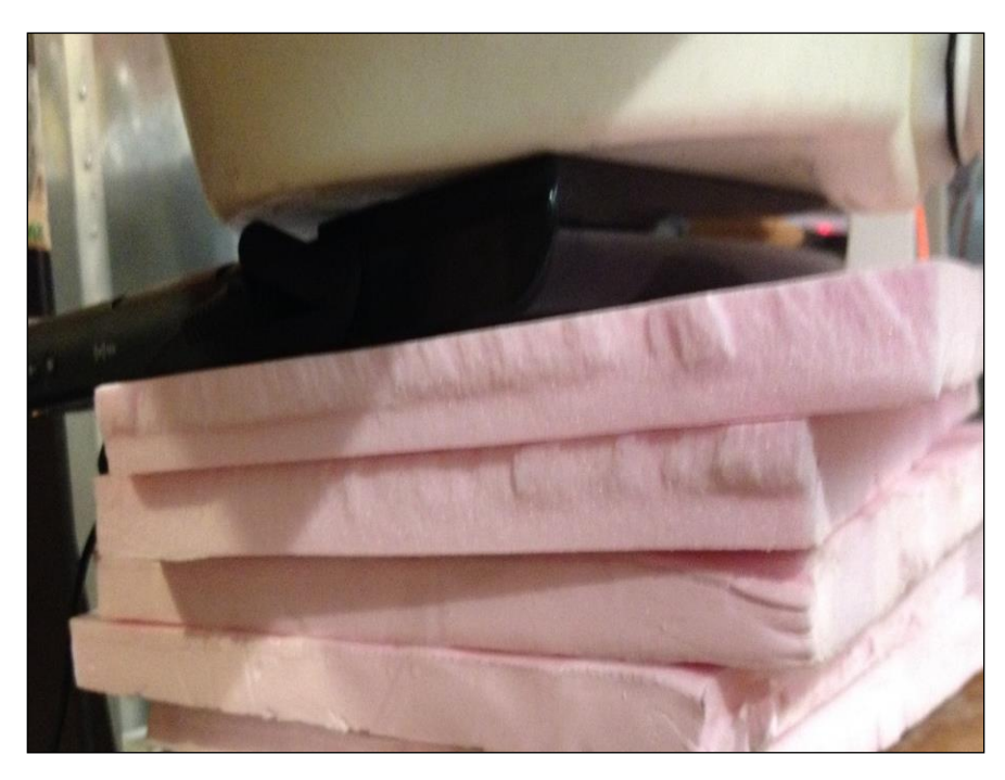
Photograph 1. Back Side of the Unit against Phantom