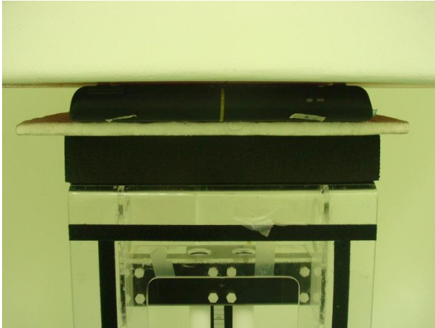
Bottom Face of DUT with Phantom 0 cm Gap