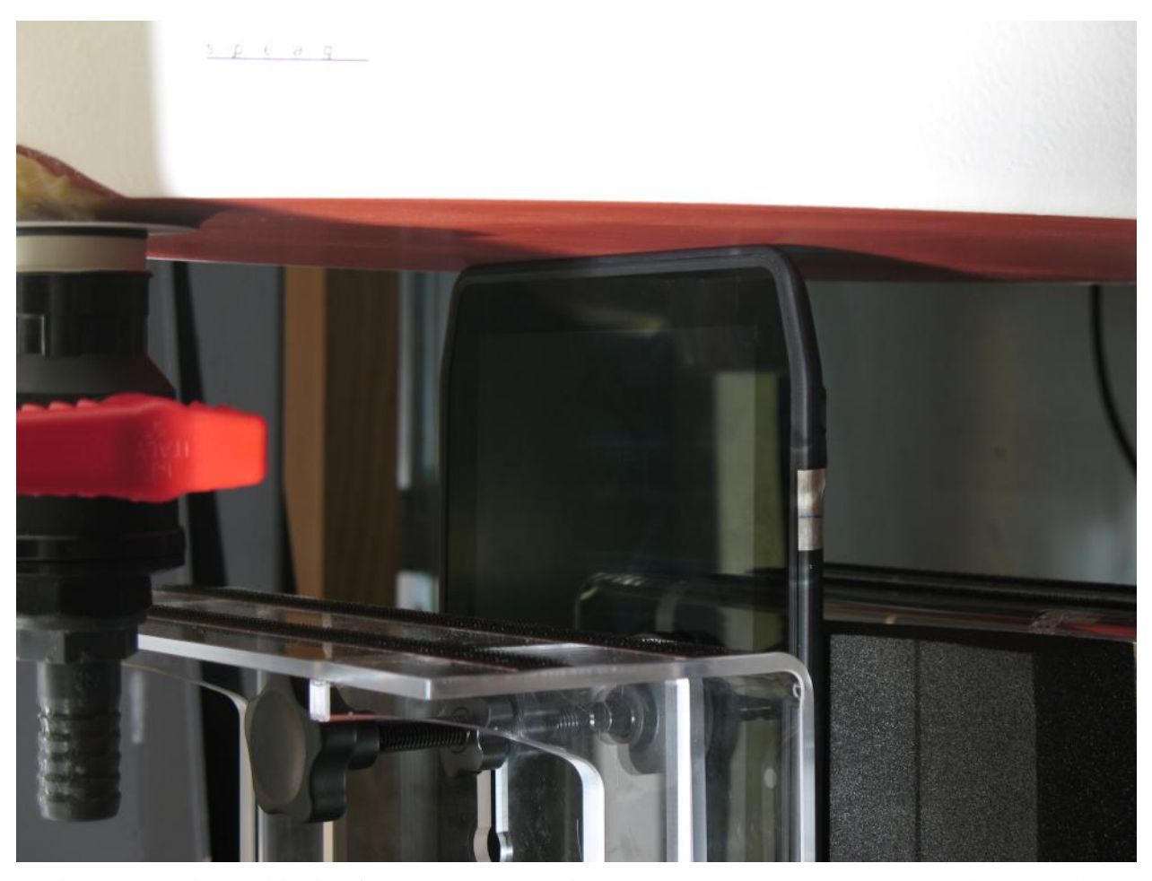
Figure 7: Device Positioning for SAR Scans – Left Edge Nearest WWAN Antennas with no Spacing