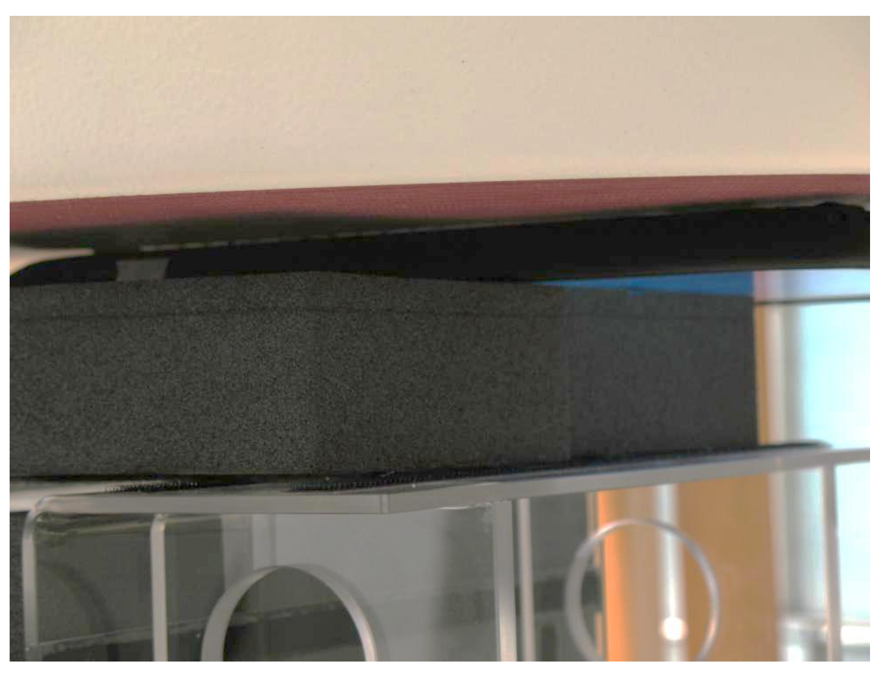
Figure 1: Device Positioning for SAR Scans – Back Against Phantom with No Spacing