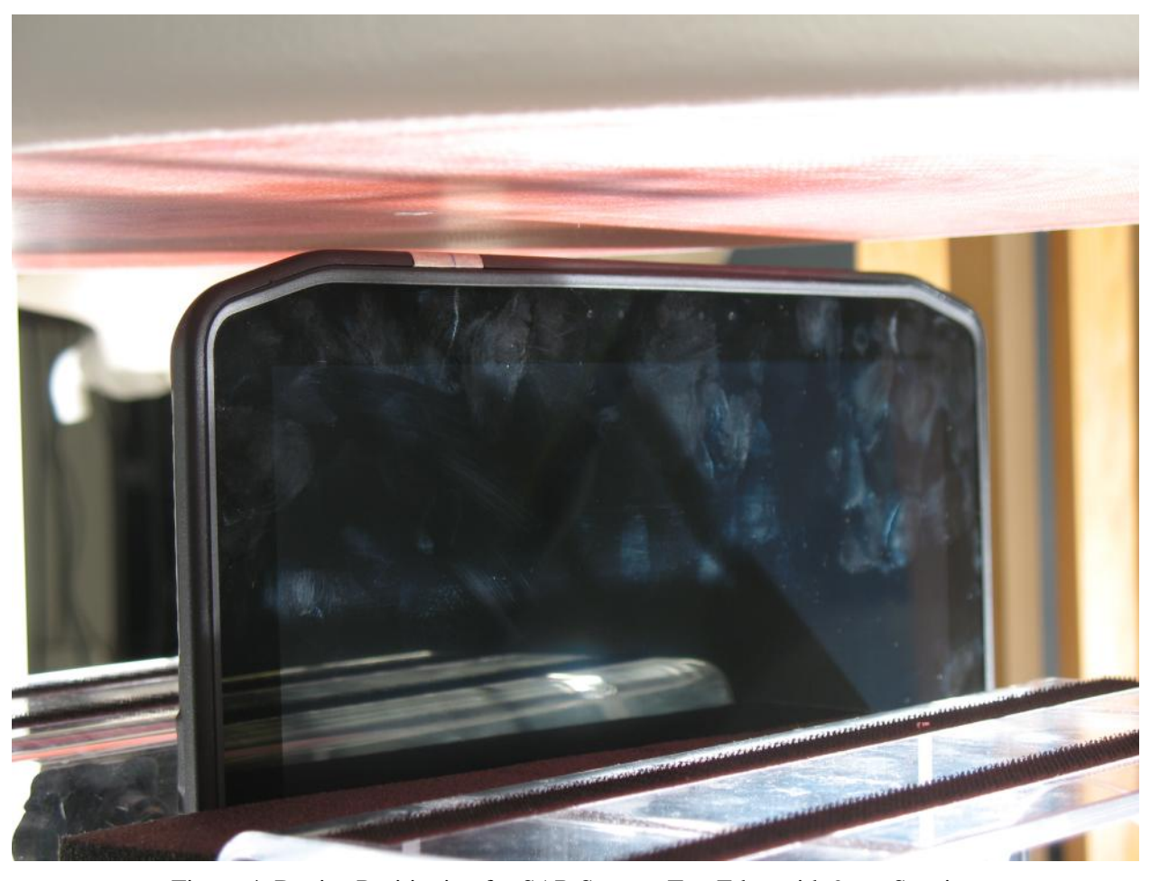
Figure 4: Device Positioning for SAR Scans – Top Edge with 9mm Spacing