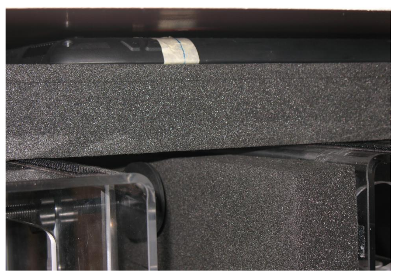
Figure 2: Device Positioning for SAR Scans - Back Against Phantom with 5mm Spacing