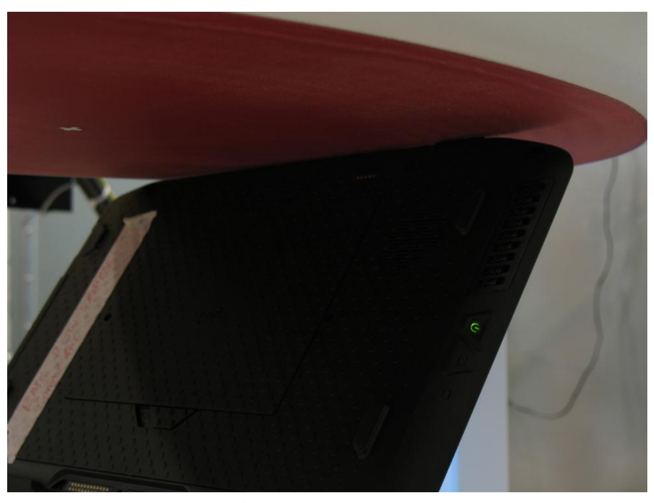
Figure 5: Device Positioning for SAR Scans – Top Edge Tilted 57 deg with no Spacing