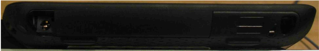
Tablet Right Side