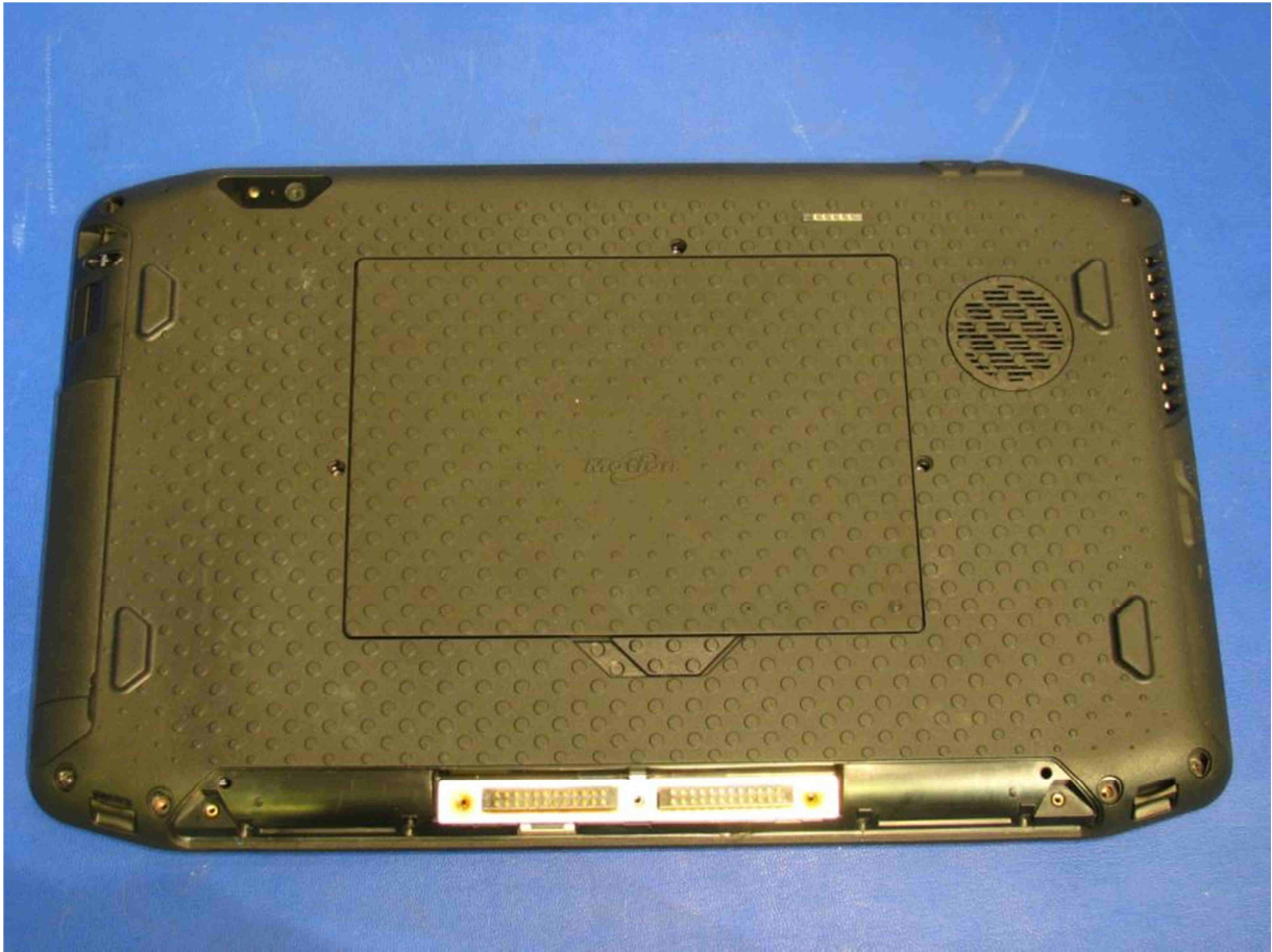
Tablet Back Side