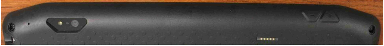
Tablet Top Side