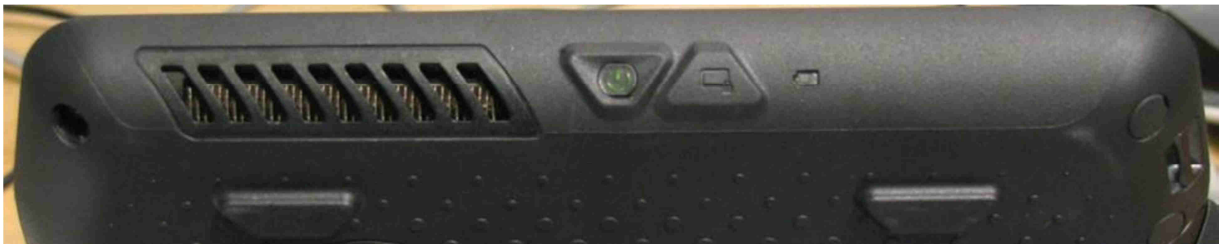
Tablet Left Side