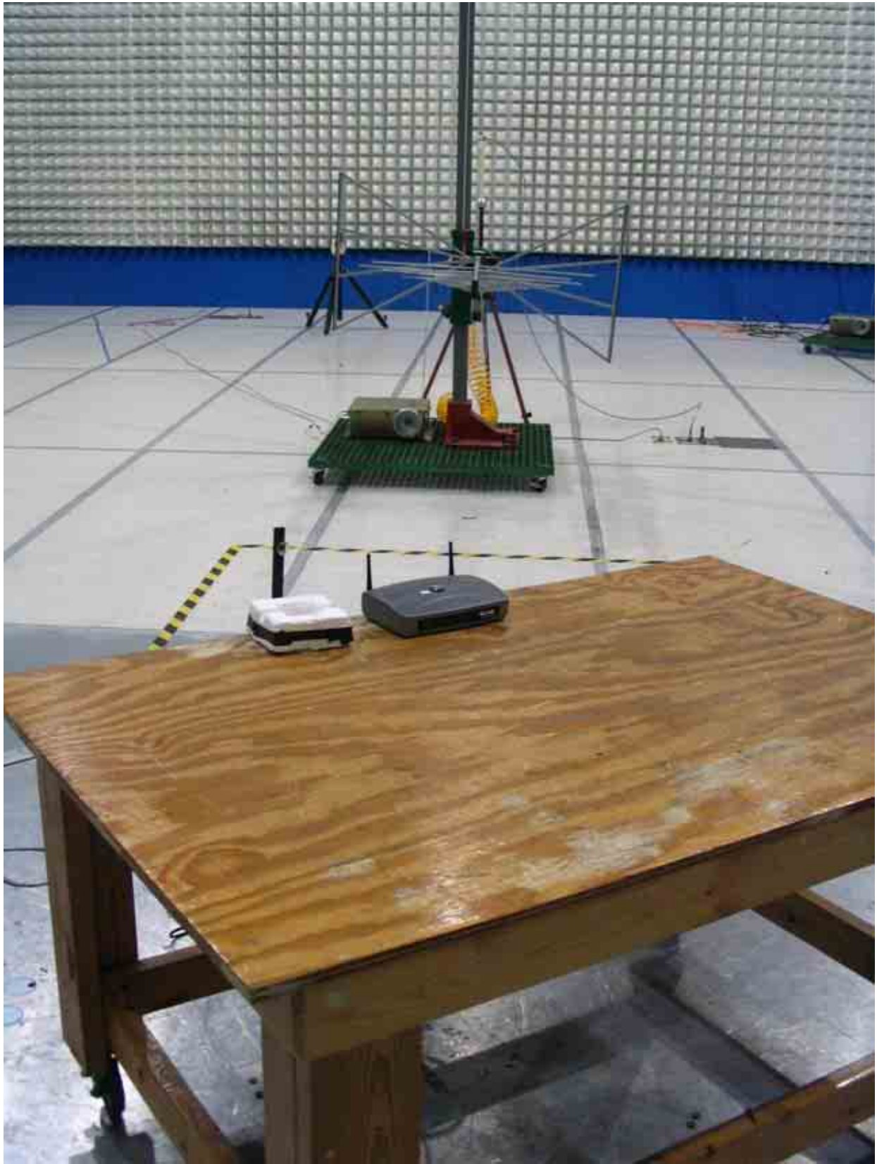
Figure 3: Radiated Emissions Testing (Front)