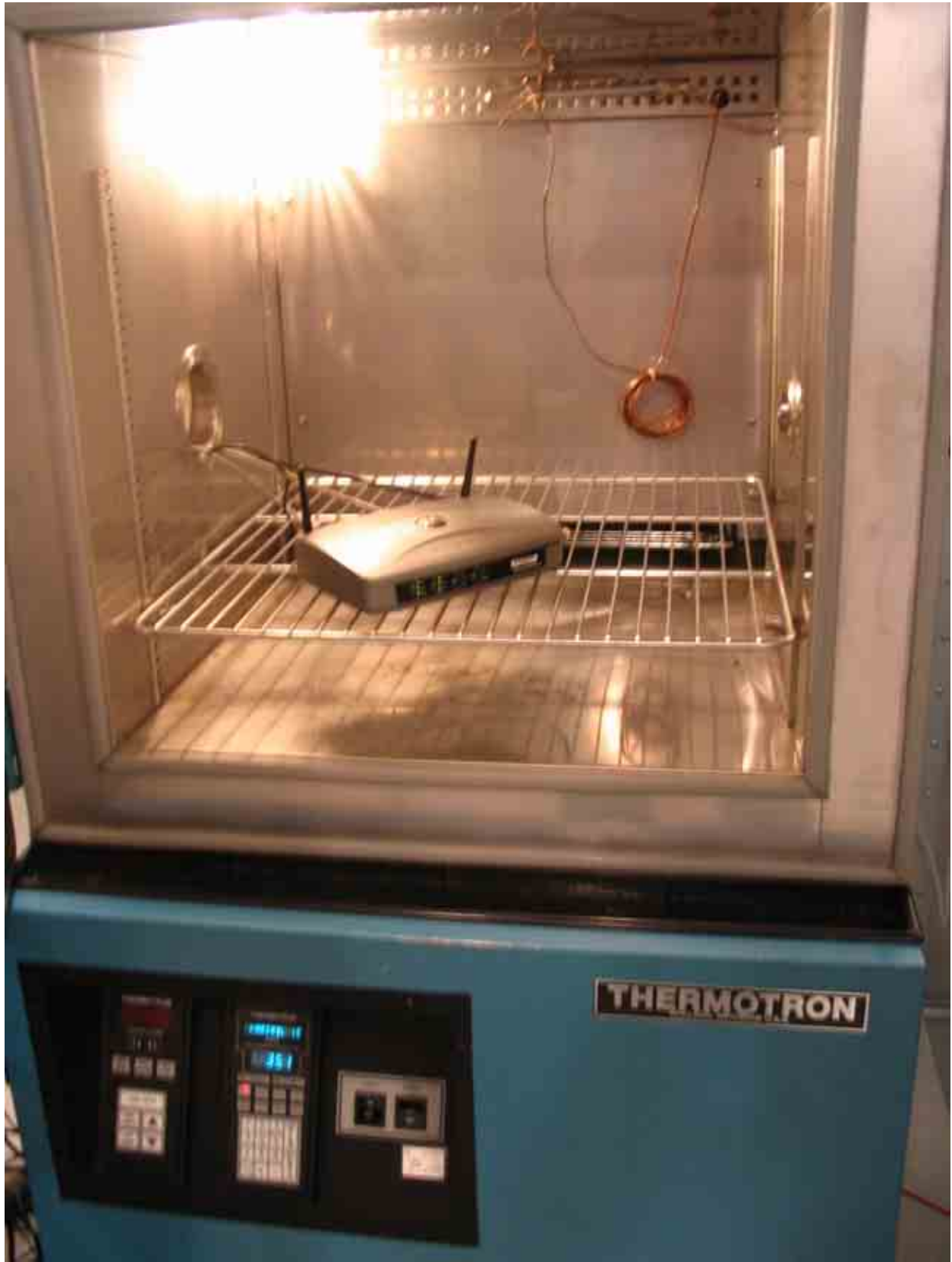
Figure 5: Frequency Stability Testing (Test Sample in Chamber)