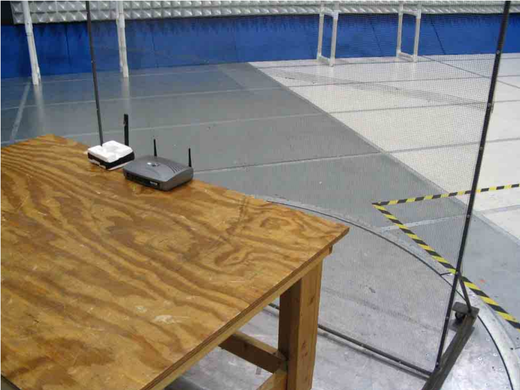
Figure 2: Conducted Emissions Testing (Front)