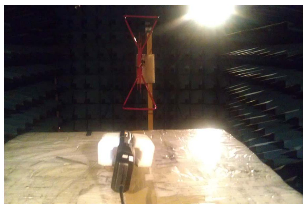
For GPRS 1900 / EDGE 1900