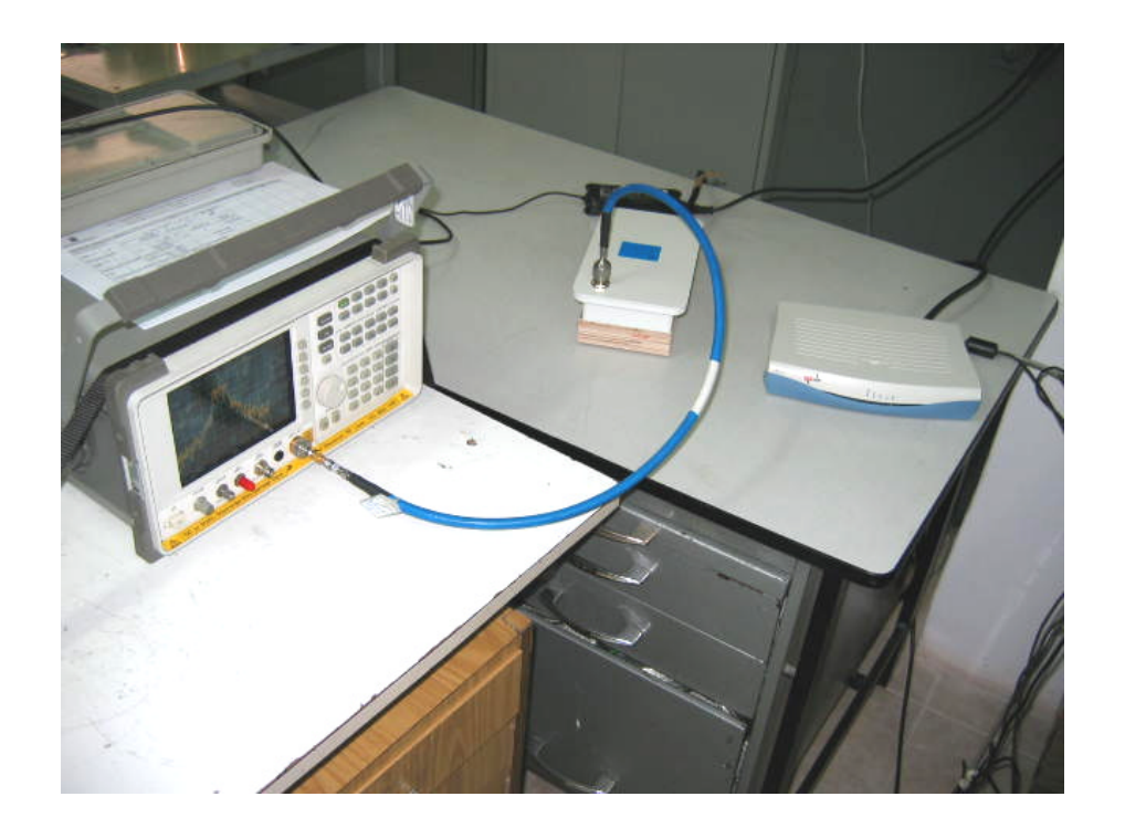
Photograph No.1 Peak output power, occupied bandwidth, emission mask measurement setup